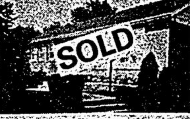
30 ELM ST. PAULA PERCY