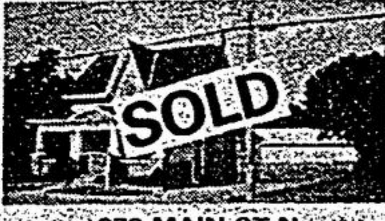
272 MAIN ST N GEORGE CROMPTON