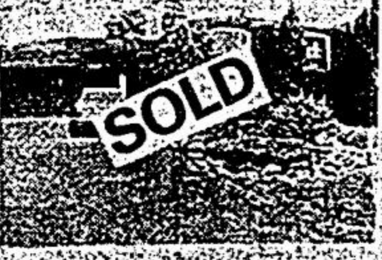
10 HAMILTON HALL DRIVE LILLIAN SIEVANEN