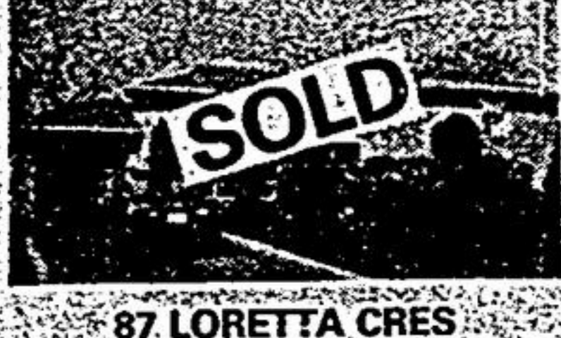
87 LORETTA CRES. LARRY RAYMER/RODEEN ANTROBUS

STOUFFVILLE CHARMER 3 bdrm. older home, shady yard, new kit. cupboards, lg. lr. & wood stove, close to amenities. Ideal for young family. $169,900. Sheila Disney, 294-1372 ext. 243.