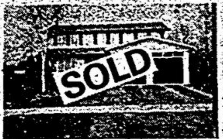
27 EMMELOOR CRES. MAVIS SMYLLIE