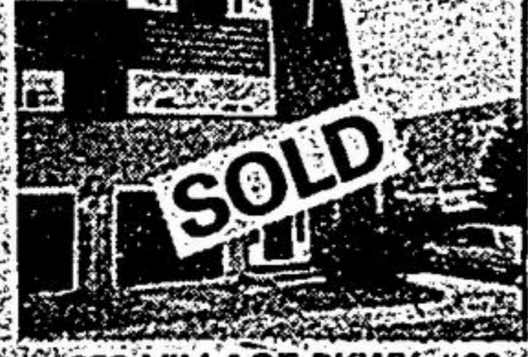
653 VILLAGE PKWY #68 MAVIS SMYLLIE