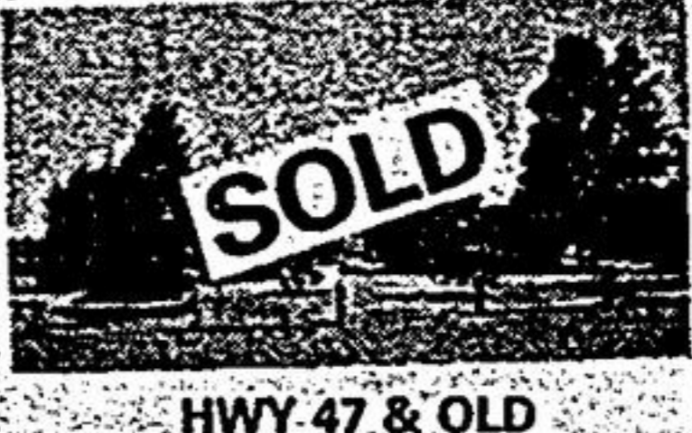
HWY 47 & OLD STOUFFVILLE ROAD. SHERRY O'NEIL

FABULOUS CRESCENT UNIONVILLE — $289,000 Features: Dr. addition, 2 w/o to inground pool, upgraded kitchen, oak cpbds, dark parquet floors, oak rail, main floor family room & laundry room. Mavis Smyllie, 477-1270.