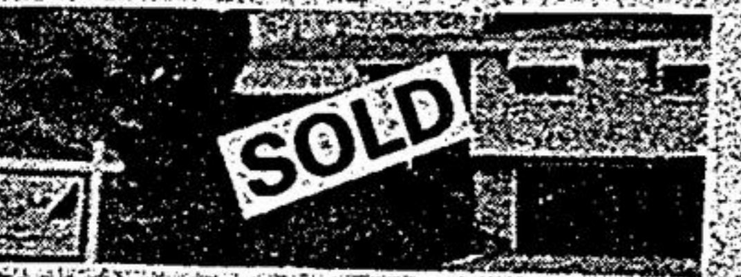
38 CHRISTMAN $239,000