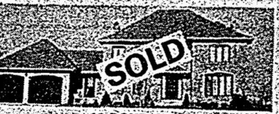
19 BOYD CT $375,000