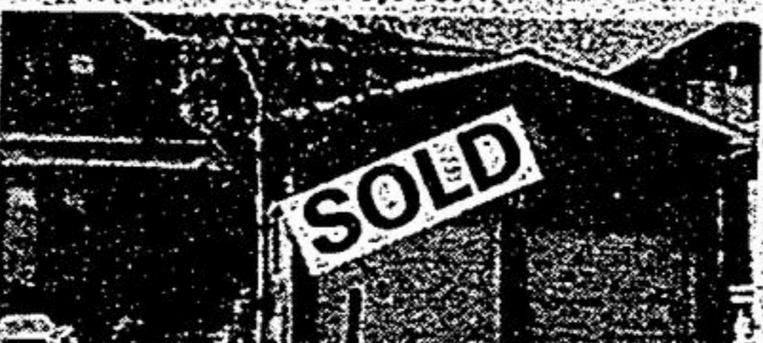
42 LONG ISLAND $329,000