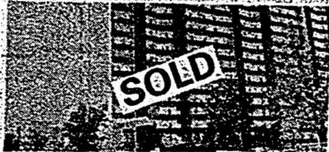
TRIDEL CONDO $138,000

SOME OF OUR MOST RECENT SALES (LIST PRICES)