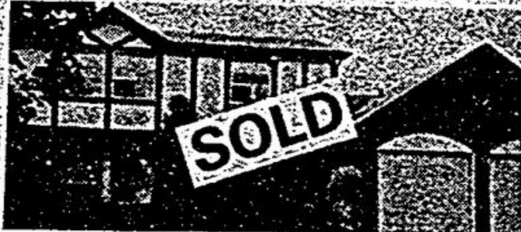
110 SIR LANCELOT $239,000