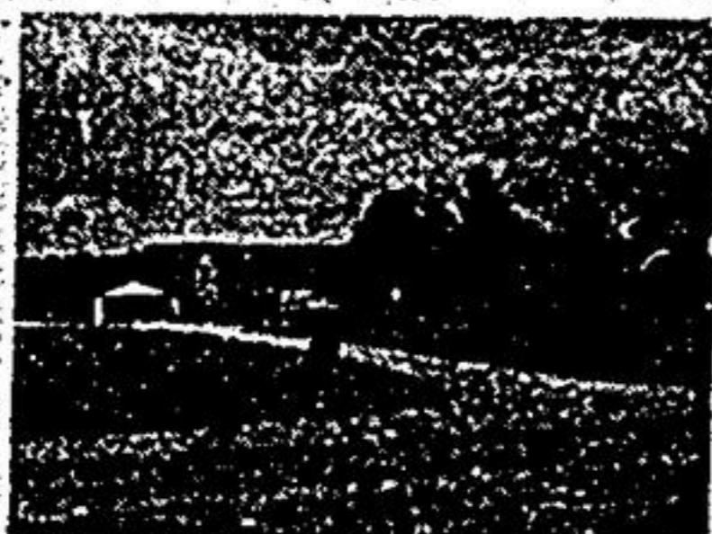
UXBRIDGE 1 ACRE

Maintenance free exterior, huge master bedroom with walk-in closet and ensuite, rec room with fireplace, pine bar and walkout, 4 vehicle double garage, rear yard children's activity centre. $189,900. Call Ian Morrison at Res: 852-5592, 640-6755 or 1-800-263-3288. Re/Max Scugog Realty Ltd.