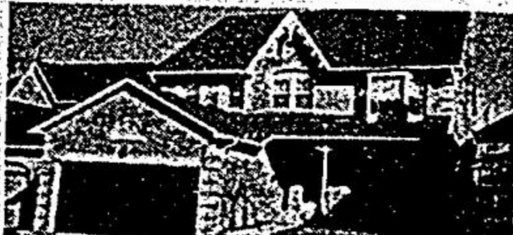
BRIDLE TRAIL MONARCH

Beautiful 1 yr. old executive home. Over 3,600 sq. ft. of quality, upgrades, hardwood, neutral decor, a showpiece to view. Contact Joanne Bond 294-1372.