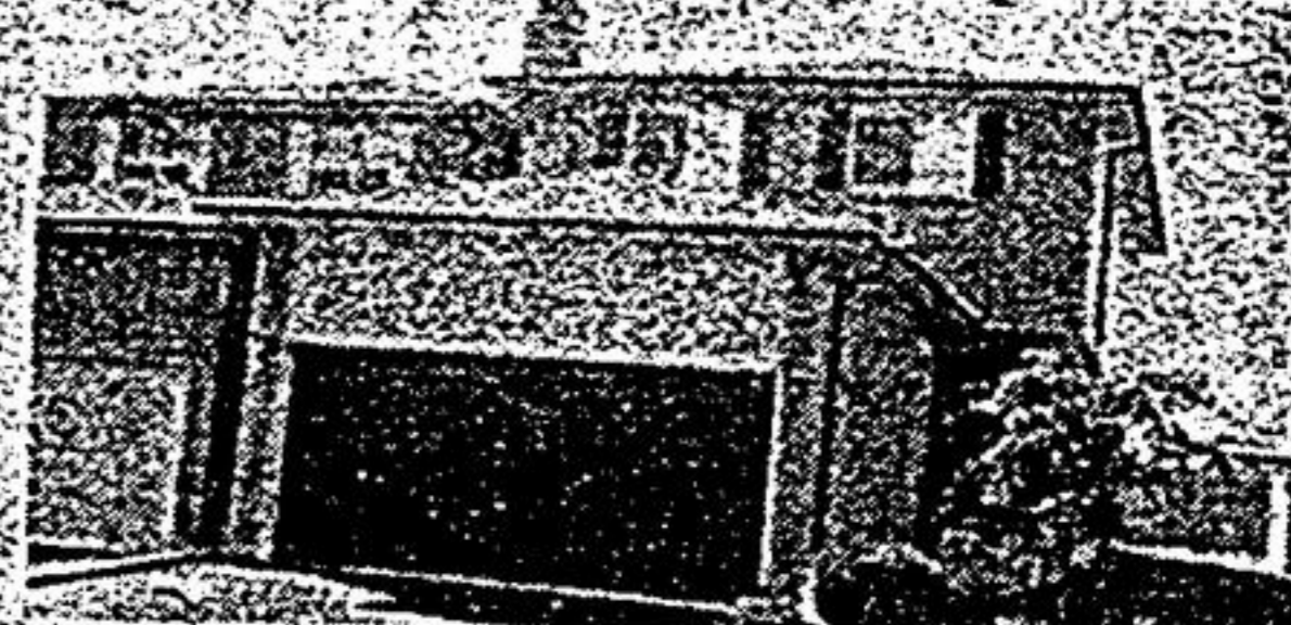
JOIN US FOR OPEN HOUSE SUNDAY 2-4