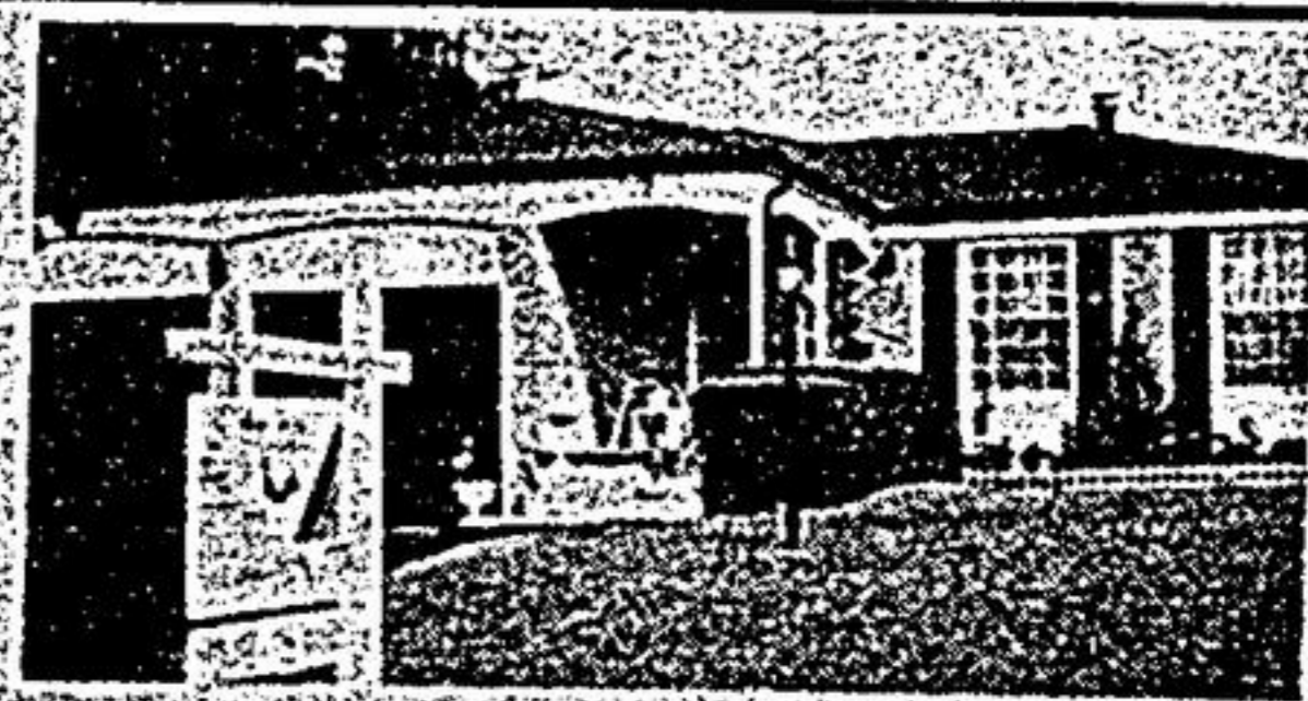
JUST REDUCED TO $229,900