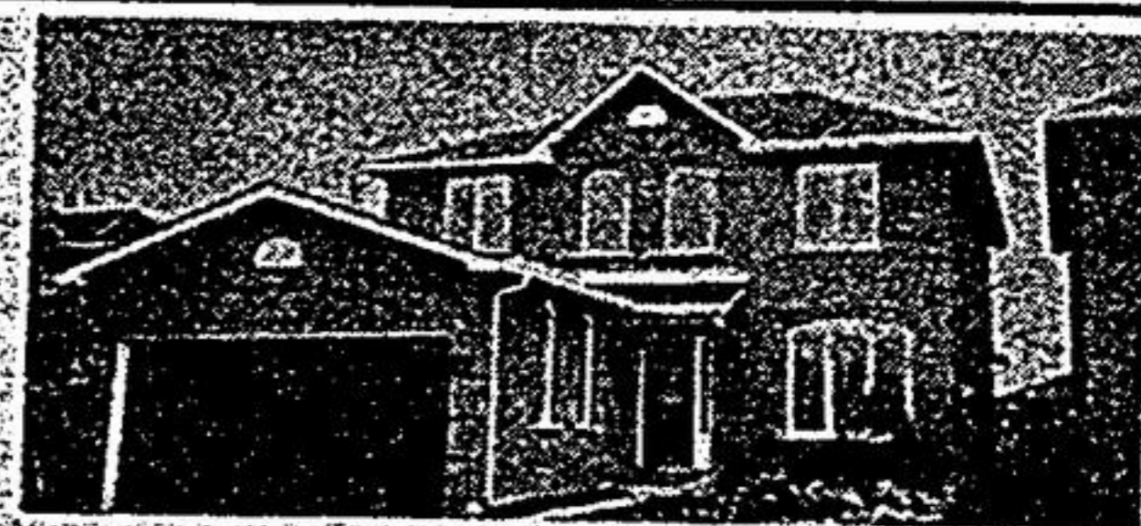
WE'VE JUST LISTED FOR YOU - 17 SANDERLING