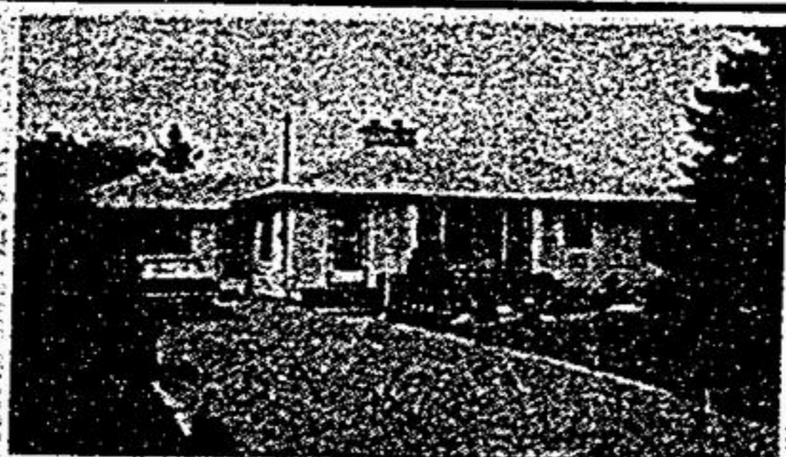
BUSINESS OPPORTUNITY STOUFFVILLE

3 bdrm. bungalow, lot size 100 x 254, adj. prop. lot size 72 x 264, 2 storey 3 bdrm. live in one use other as office. $425,000. Yoke Bouwmeister 640-2082.