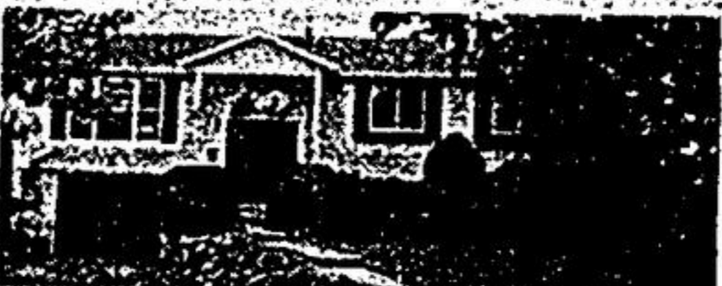
QUIET COURT - BACKS ON WOODS

Attractive 3 bdrm. raised bungalow, lovely fam. room with fireplace, den, deck, south/west exposure, close to schools & shopping. Contact Joanne Bond 294-1372.