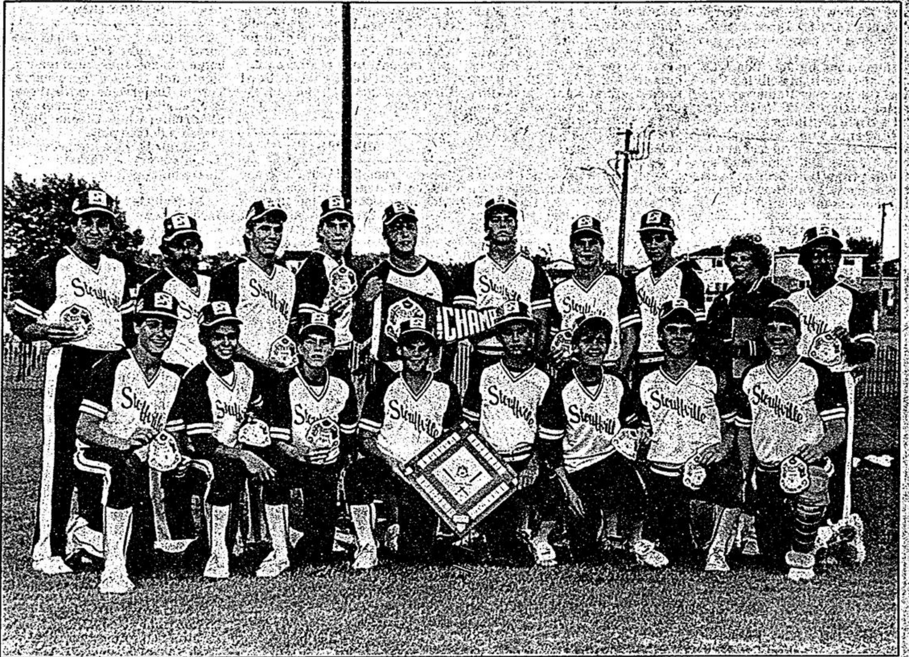
The 1987 Provincial Champions