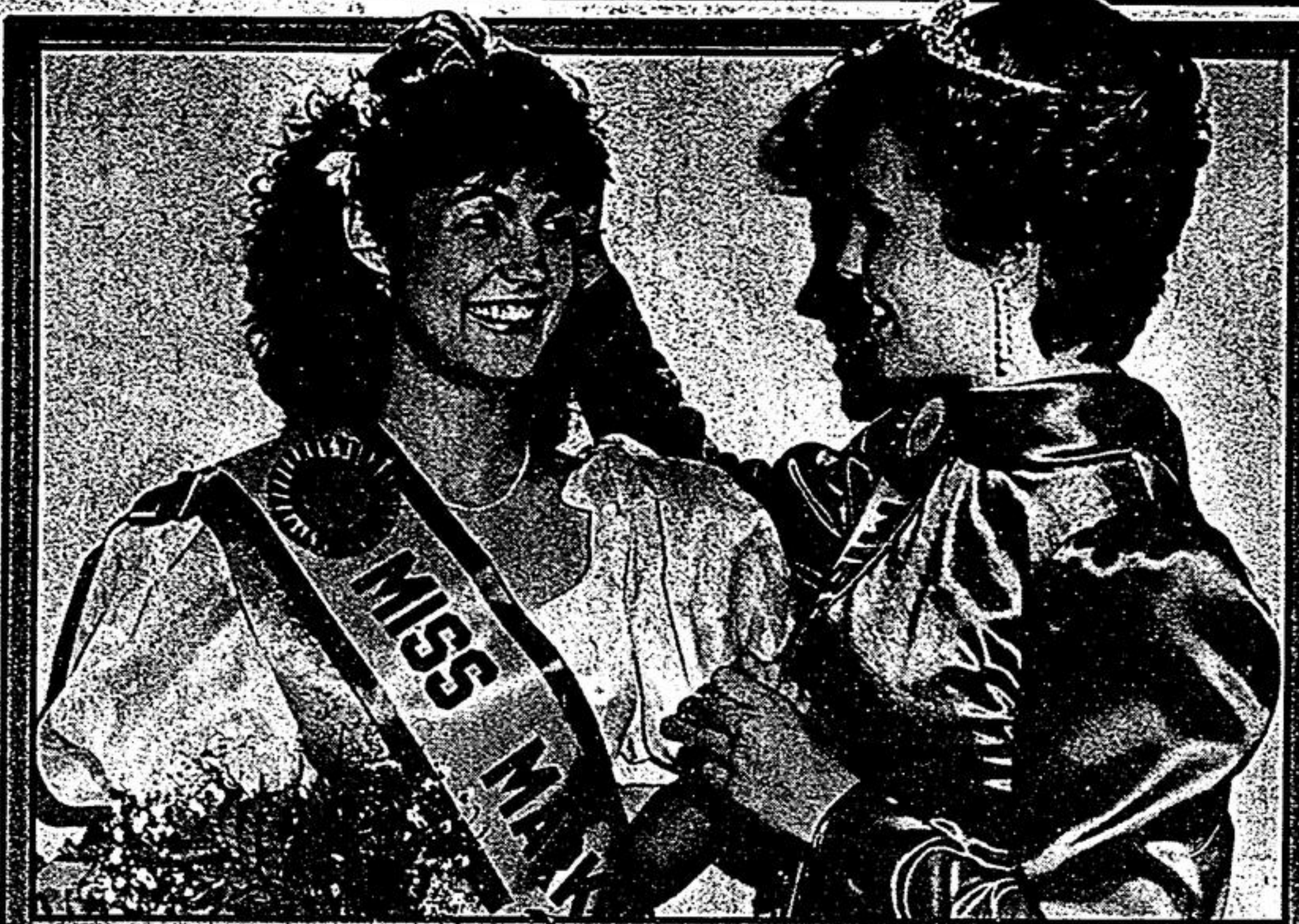
Fair Queen '86 honors her successor