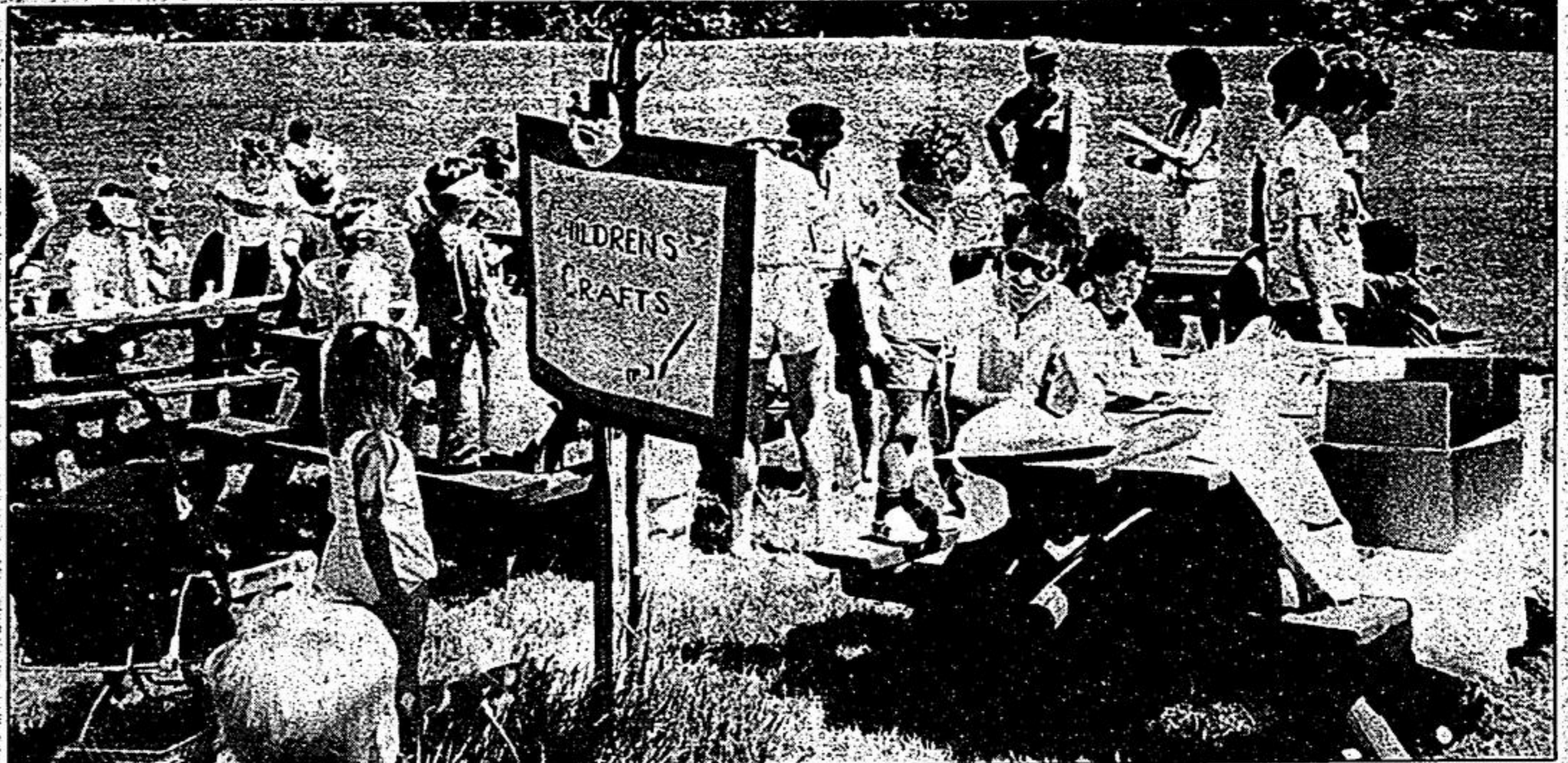
Children's crafts workshops will be set up again at Markham's Celebration of the Arts this year to encourage artistic involvement among local youth. The festival, being run at the Markham

With the new Markham Theatre and the Arts York program that encourages the study of performing arts in special high schools such as Unionville, Markham is an example of how the arts can survive as a community venture, she concluded.