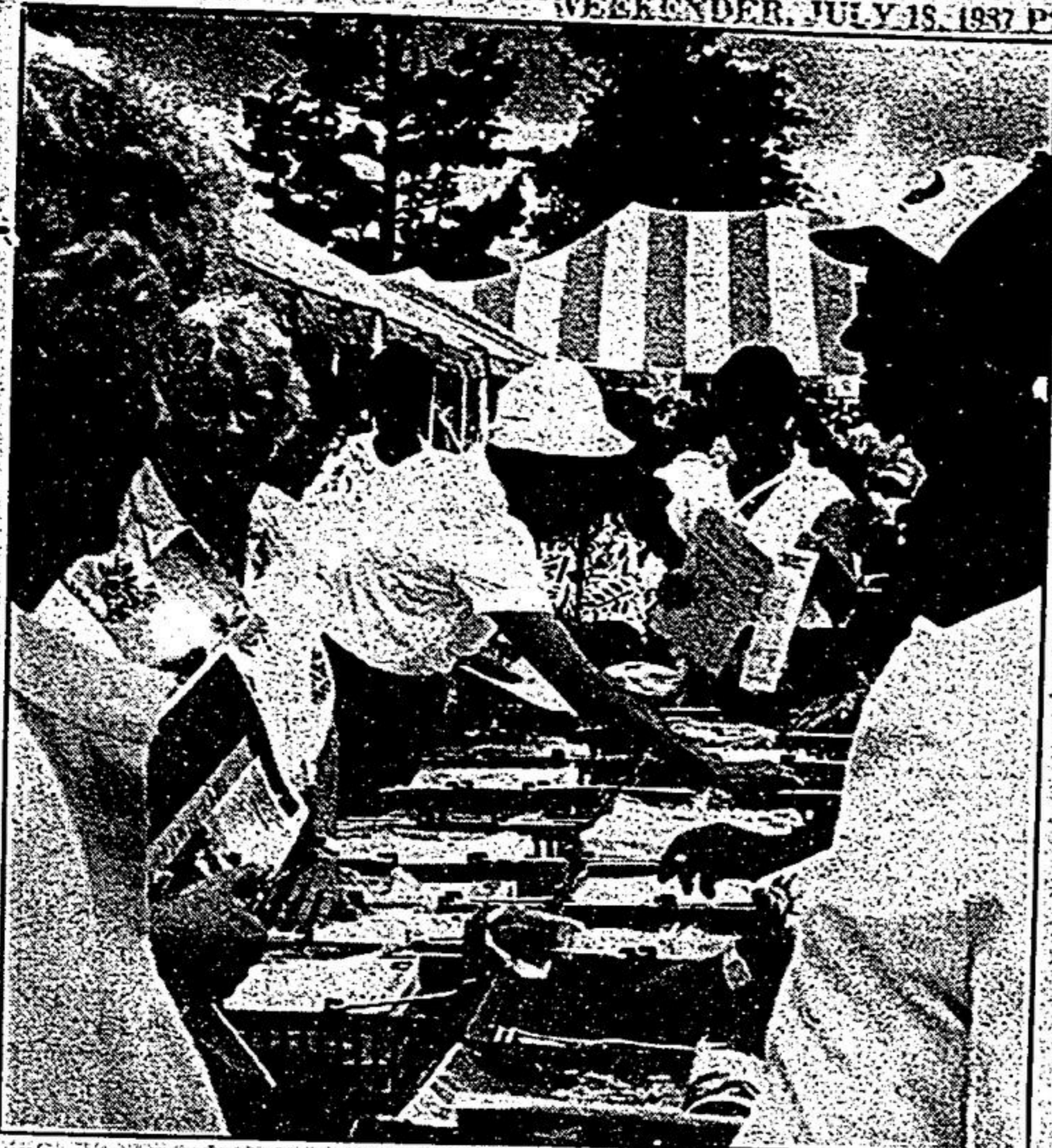
The third annual Festival of Roses will be held at White Rose Nursery's Sandoon Farm next Friday and Saturday.