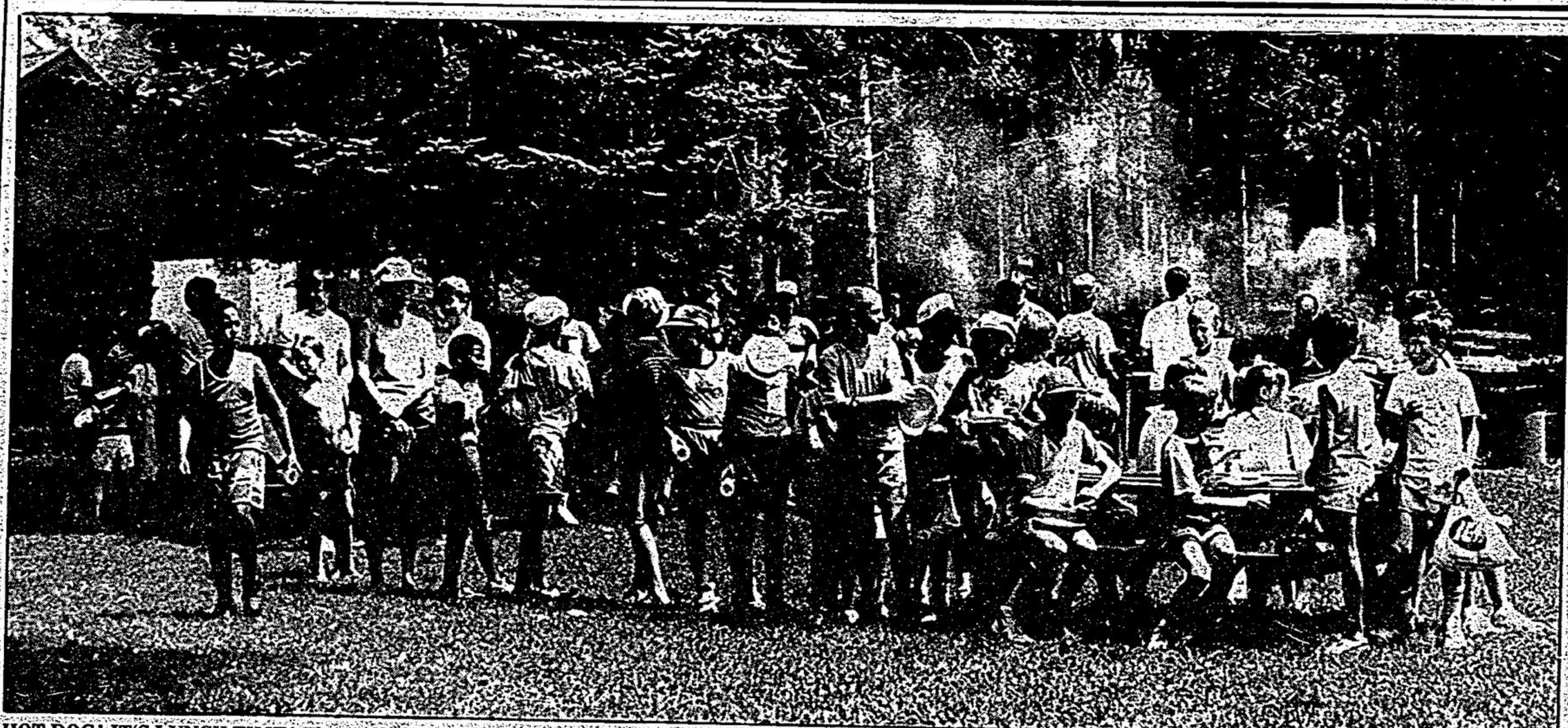
HOT DOG! IT'S LUNCH TIME! The staff of Pleasure Valley cooked up a storm for more than 350 hungry children last Friday. In addition to the ever-popular hot dog, there were hamburgers and cold drinks to satisfy those voracious appetites.