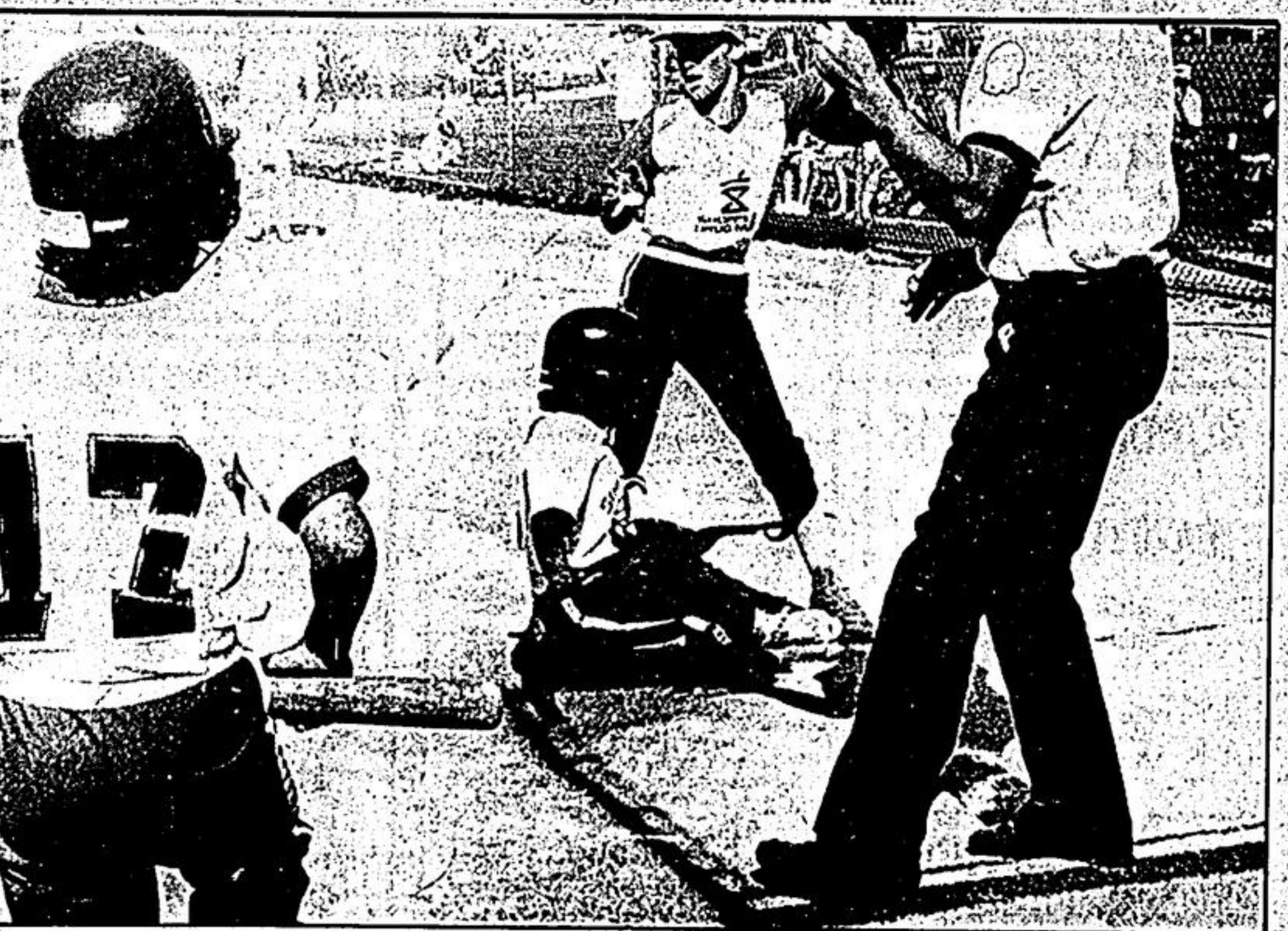
Slidin' home safely

"We only had one substitute for three games in that heat," he said. "You just can't win in that situation. It was a good tournament though, well-run and a lot of fun."