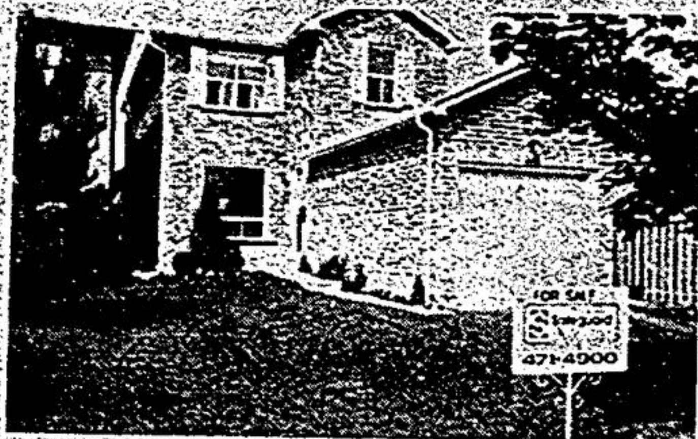
OPEN HOUSE SAT. & SUN. 2-4 111 MERCER CRES.