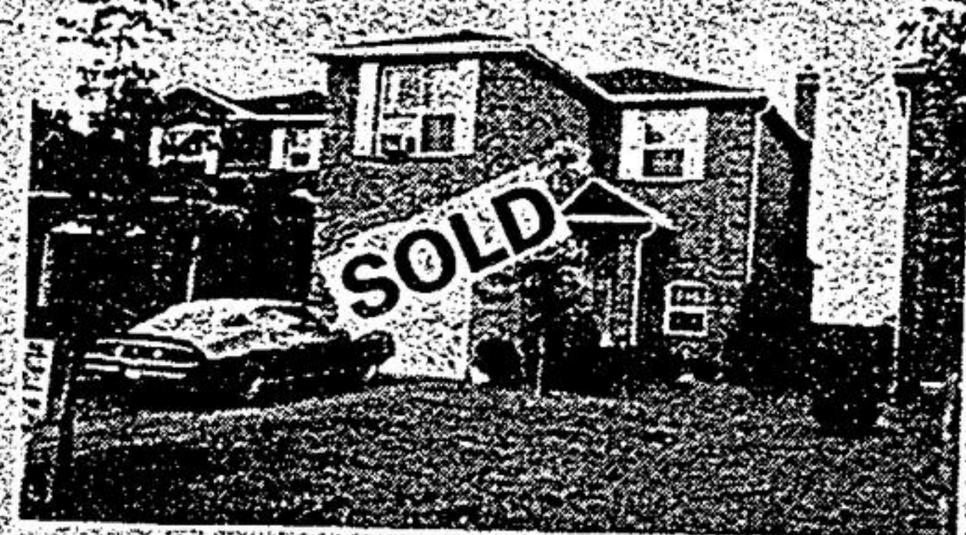
MARKVILLE "SPECIAL" AT $162,900.

MARKHAM - 1800 sq. ft., 7 rooms, lots of parking. STOUFFVILLE - 2 levels, 600 sq. ft. on each floor, unlimited potential. Call Earl Atkinson or Bill V. Mitkos 471-4900.