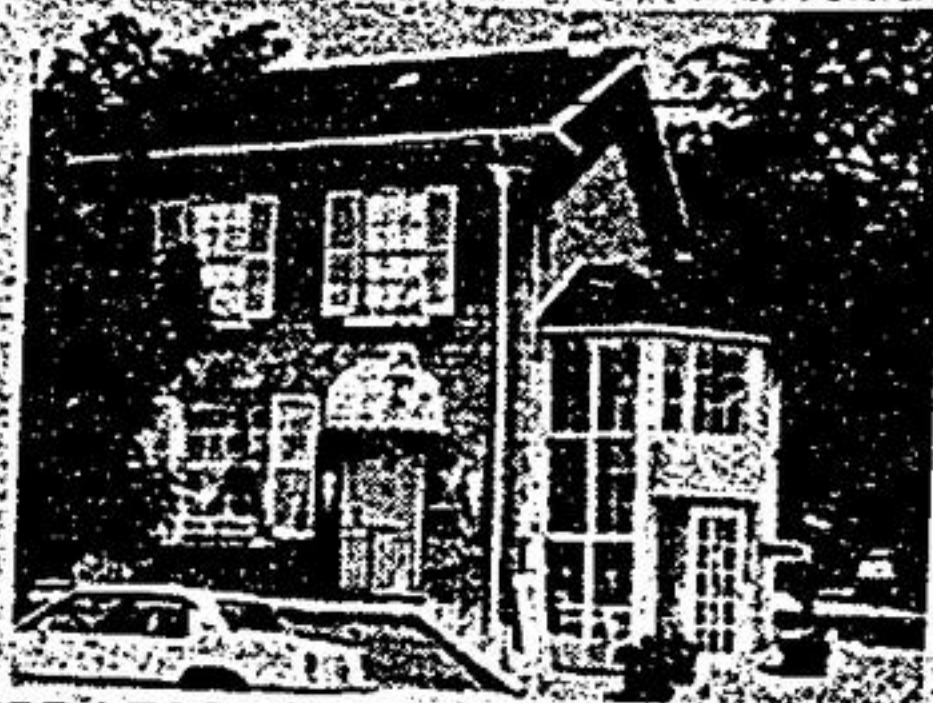
FOR LEASE! DOWNTOWN CORE OF MARKHAM-STOUFFVILLE

LOCATION! LOCATION! LOCATION! HWY. 48 JUST NORTH OF THE 17th LINE 52 acres mixed bush & stream. Land is mostly cleared. Call Earl Atkinson or Bill V. Mitkos 471-4900.