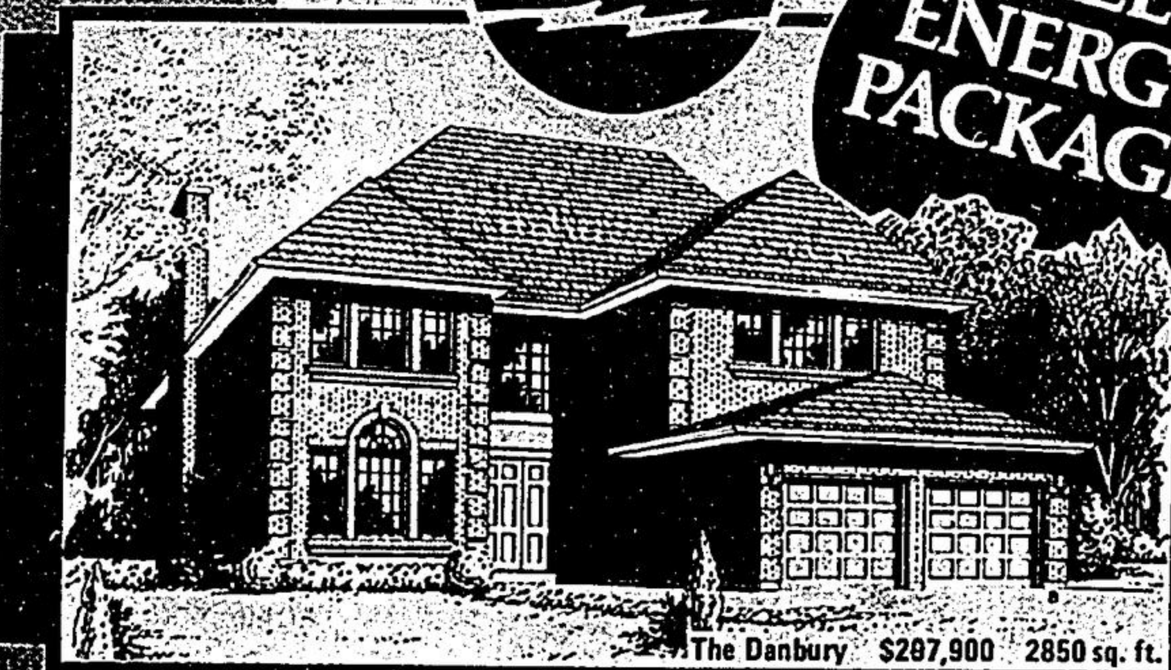
The Danbury $297,900 2850 sq. ft.