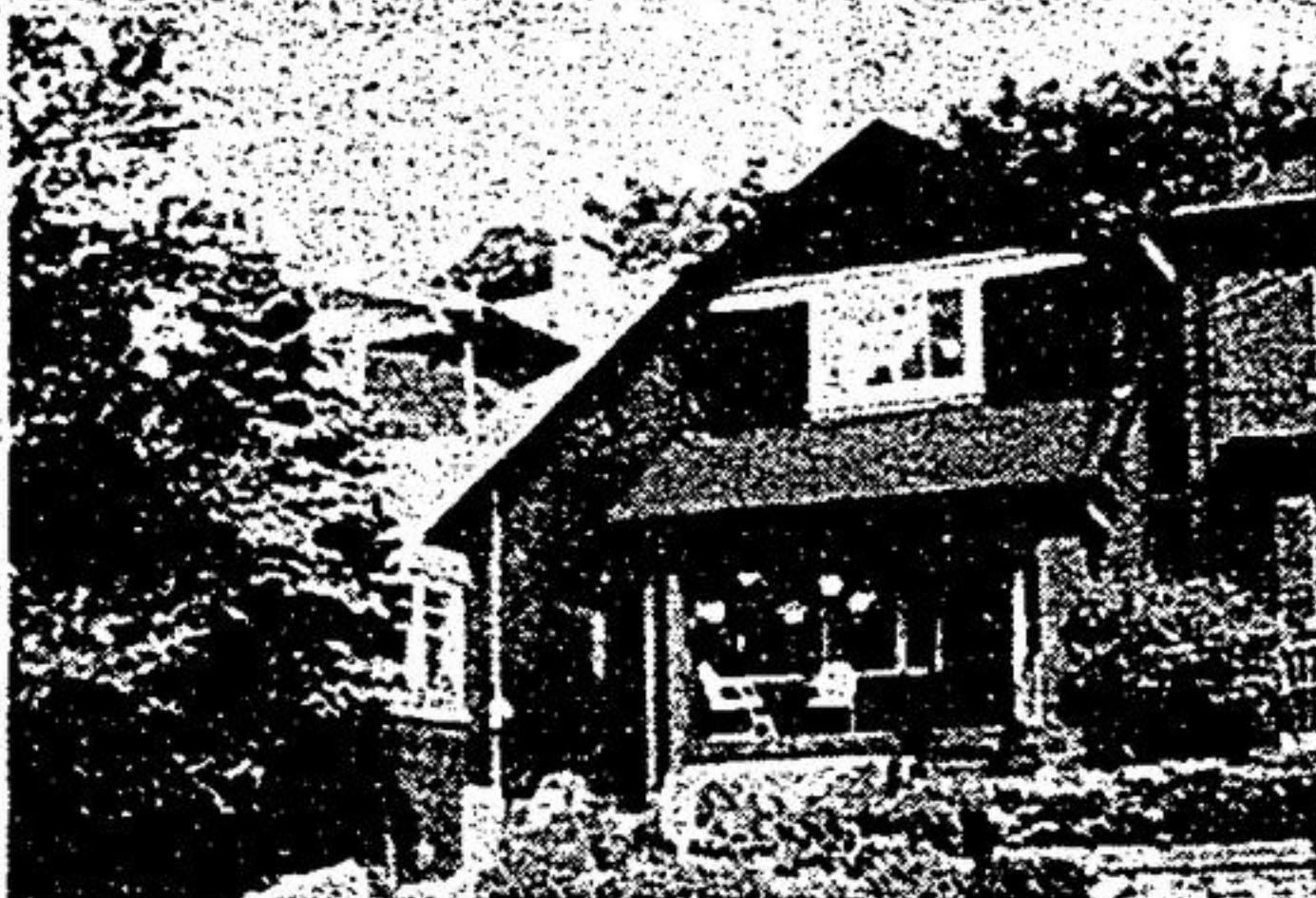
LOCATION - LOCATION - LOCATION DOWNTOWN WITH PRIVACY

If you are looking for a clean, well-kept home this is it. Neutral decor, upgraded kitchen, B/I dishwasher, main floor family room, F/P, W/O, 3 B/R master has large W/I closet, fully fenced yard with 11 x 20 wolmanized deck. Earl Atkinson or Bill Mitkos 471-4900.