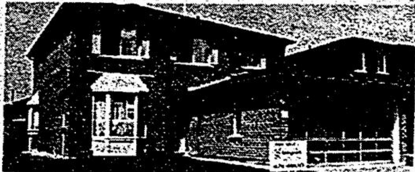
OPEN HOUSE SUN. JUNE 14/87, 1-4 THE CLASSIC OF RAYMERVILLE DR. 284 RAYMERVILLE DR.