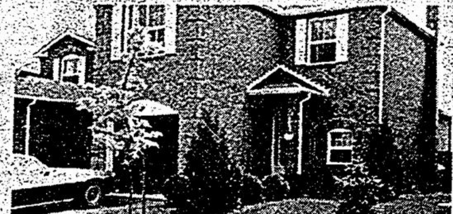
PRICED TO SELL! $167,900.

The greatest privacy on your backyard, pond, cottages, stream, pinetrees, the 3,000 sq. ft. house suitable for any professionals, stores, restaurant or you may open your own vacation (health) spa. Asking only $535,000. For viewing call Mary Staffer 471-4900.