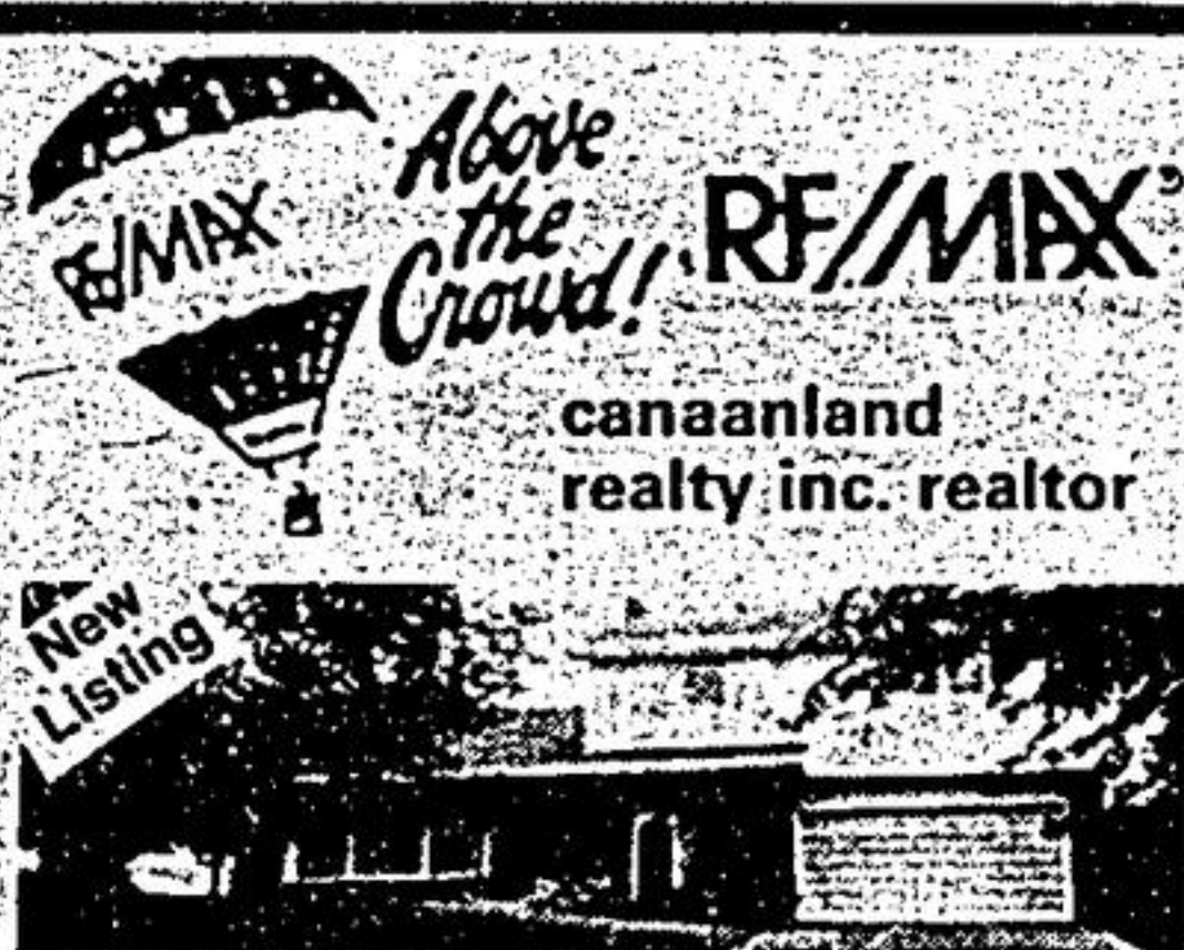
NORTH PICKERING RR#1, BROOKLIN $259,000

Beautiful 3 bedroom open concept bungalow, wood stove, finished basement, sun-deck; backs onto vacant land. Appraised at $143,000. Will accept $129,900. Phone 640-5879 or 640-2027