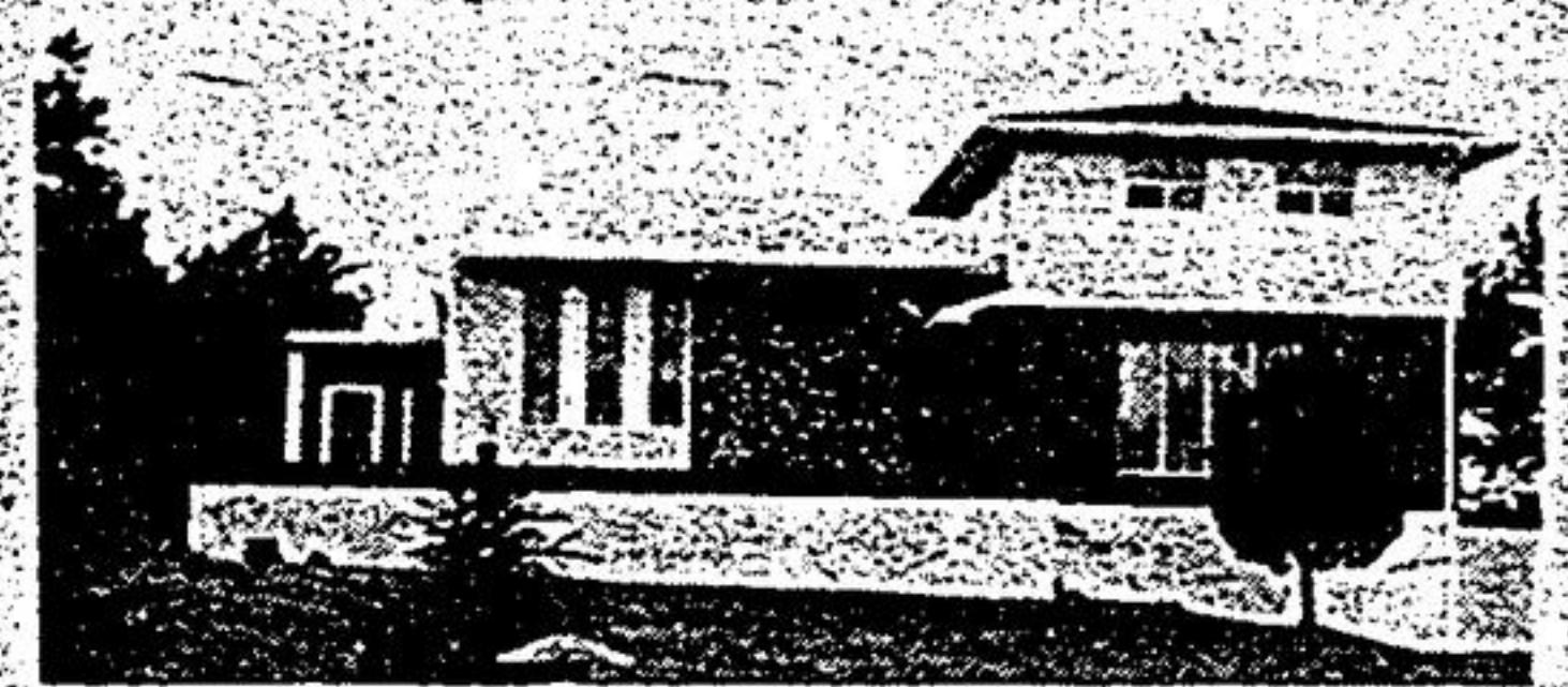
BALLANTRAE 11 ROLLING ACRES ON HWY. 48