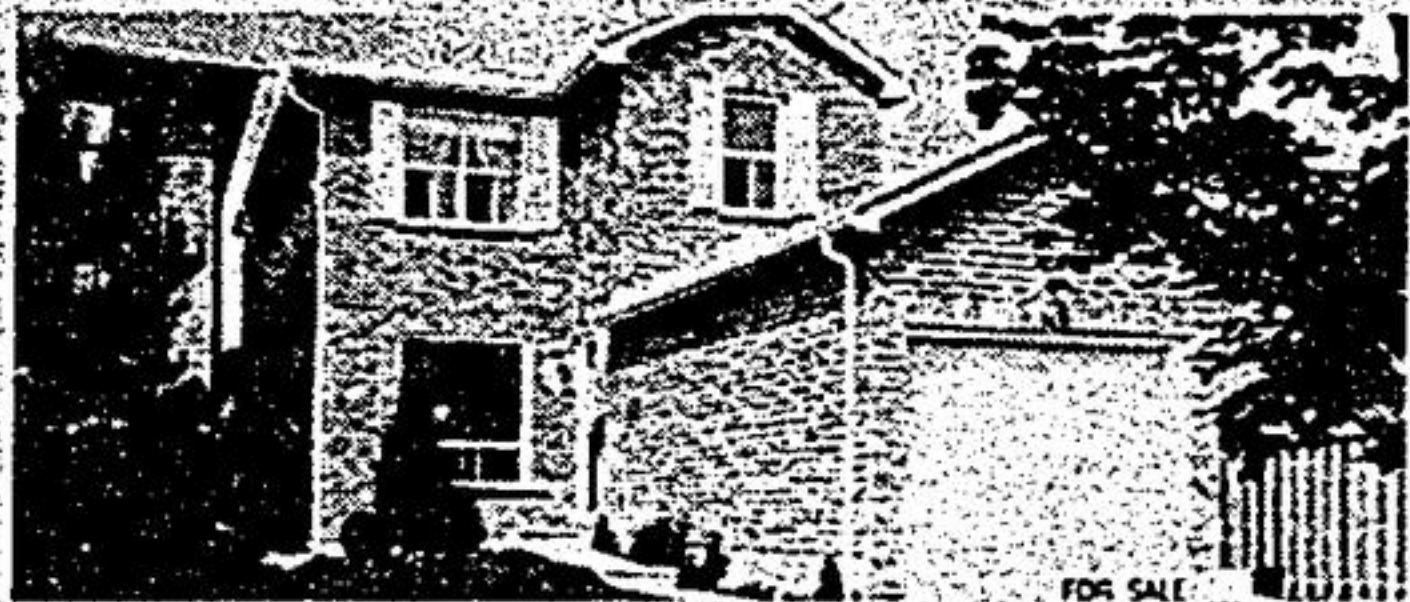
OPEN HOUSE SUN. JUNE 14/87, 2-4 111 MERCER CRES. FANTASTIC LOCATION!

Custom built luxury 2 st. 4 bdrm., 2½ baths, gleaming h/w floors, imported Italian ceramic tile, custom oak kitchen, oak stairs from basement to 2nd floor. Lennox H.E.F.A.G. furnace. Full 2 car gar. etc., etc. Earl Atkinson or Bill Mitkos 471-4900.