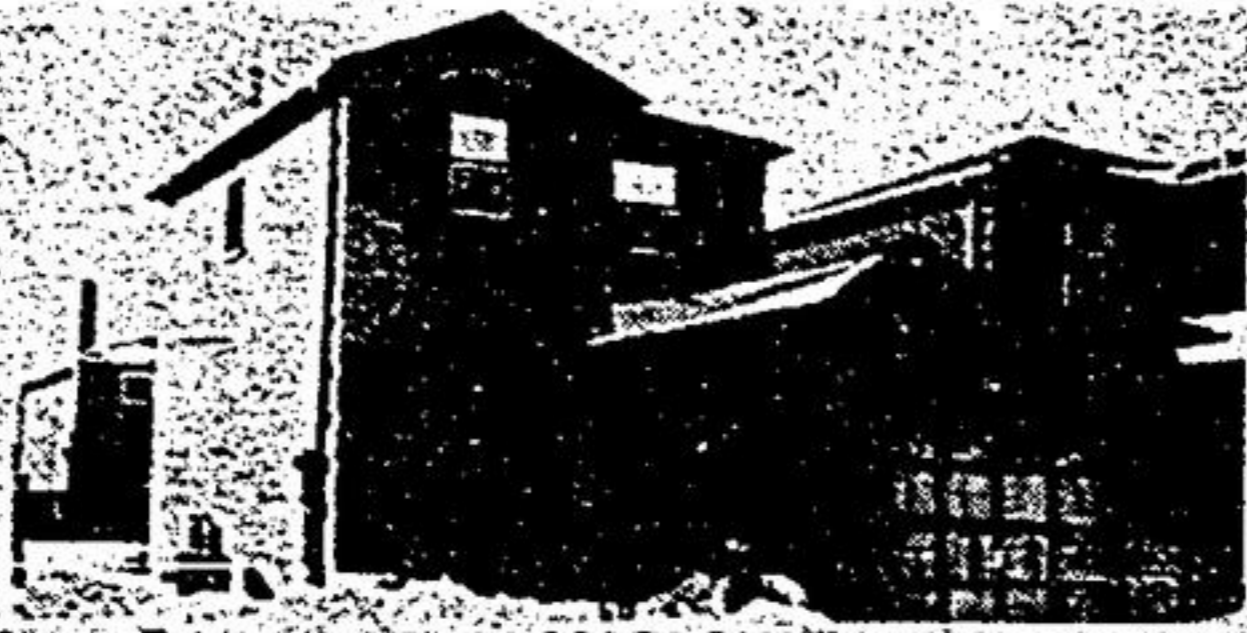
14 MARLOW REDUCED $149,900

Doll House shows to perfection, 2 bedrooms, finished recreation room with fireplace plus air conditioning, a must to see. Mary Anne MacDonald Santo Natale 477-1270.