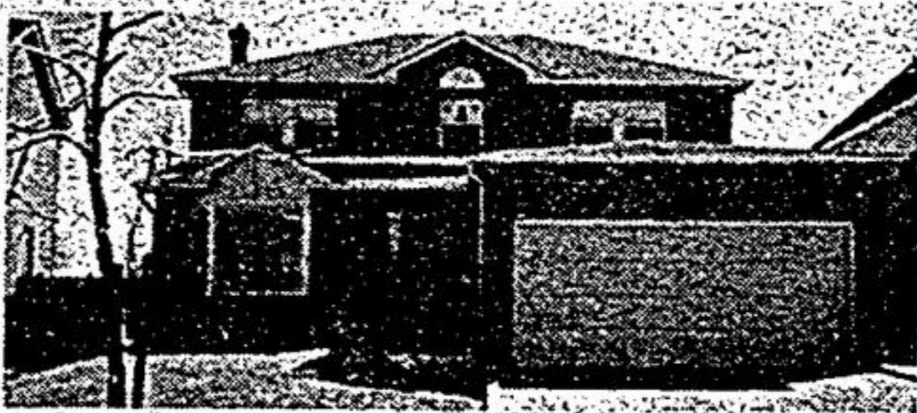
OPEN HOUSE 85 LONGWATER SUN. 2 - 4

4 Bedroom home located in the Bridle Trail, lovely backyard, extras include security system, intercom, central vacuum plus more. Mary Anne MacDonald Janice Jackson 477-1270.