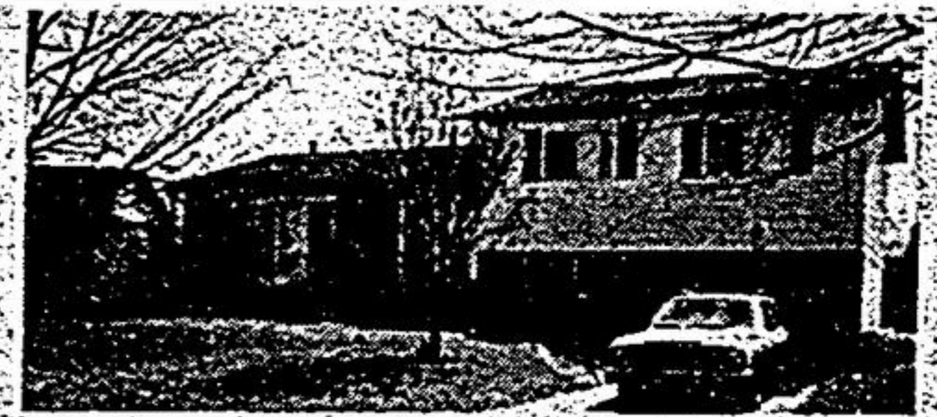
OPEN HOUSE SUNDAY 2 - 4 12 SIR ECTOR

Reduced! $223,900.00 sought after quiet court 3 bedroom sidesplit with 18 x 36 inground pool. Mary Anne MacDonald 477-1270.