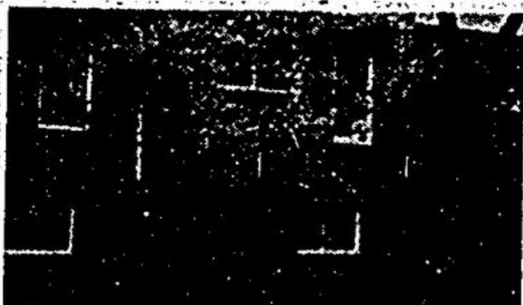
BEST BUY IN TOWN ONLY $139,500

Classy starter or retirement town home. English look setting 3 bdrm; lg. eat-in kit, neutral decor, fin. bsmt, parquet floors, ceramics + + Peggy McGlynn 294-1372.