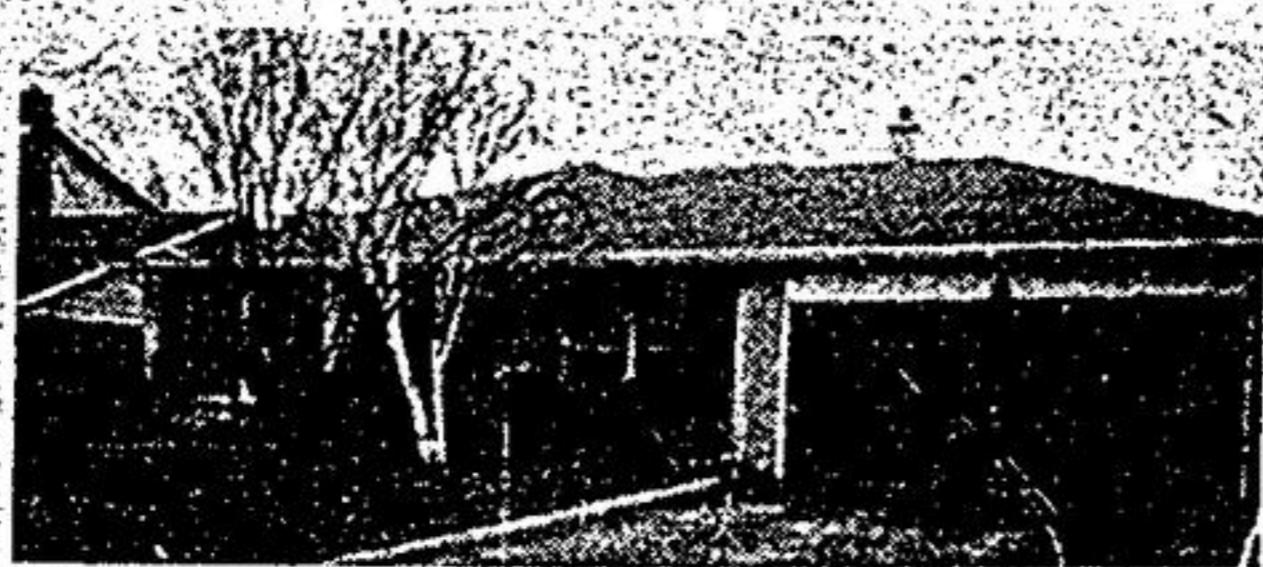
OPEN HOUSE BEAUTIFUL MATURE AREA

Sunday 1 - 4 at 73 Walkerton in the conservation area of Markham, 4 bedrooms, sep. living dining rooms, 150 ft. lot, walk to public and sep. schools. Lillian Sievanen 294-1372.