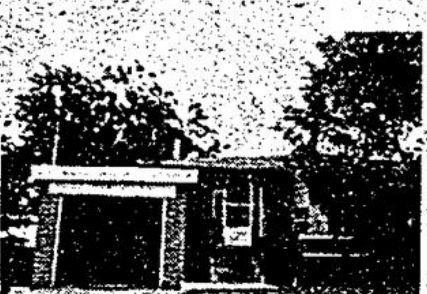
SEMI-DETACHED HOME IN MATURE AREA OF MARKHAM 4 bedrm. backsplitted eat-in kitchen, fin. rec. rm., 2 baths, deep lot, single garage, close to shops, schools. Call Virginia Northcott 474-1710 or 294-1904.