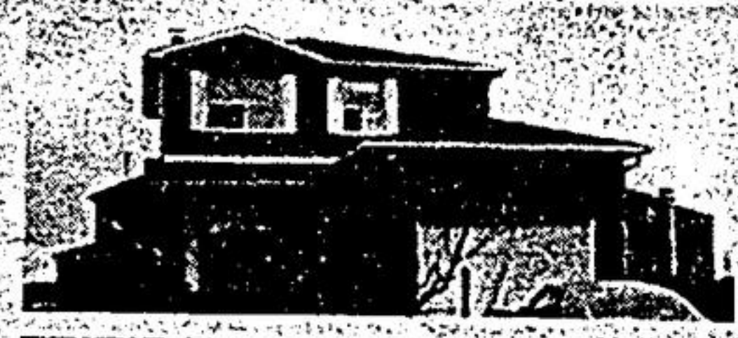
"BEST BUY IN TOWN" "IMMEDIATE POSSESSION" 3 bdrm., 2 walkouts, window coverings & appliances. Maintenance free and in TOWN. ASKING $164,900.