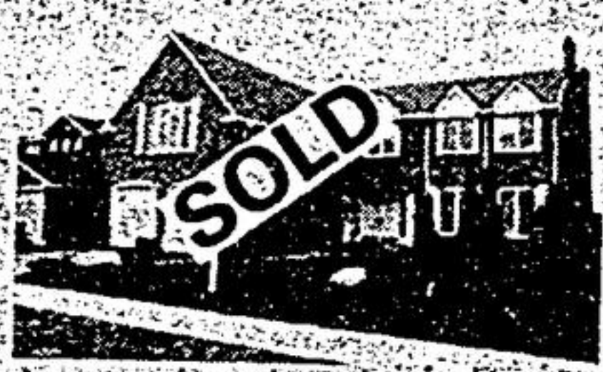
90 NORMANDALE RD. Asking $439,900. Call Rosemary Reid 479-8965 or 474-1710.