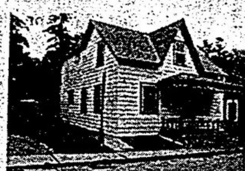
HOME IN OLD MATURE MARKHAM - LARGE WORKSHOP! 2 storey, 3 bedrm., 2 baths, large eat-in kitchen, rec. rm. potential, in-law apt. with separate entrance - deep lot. Call Virginia Northcott 474-1710 or 294-1904.