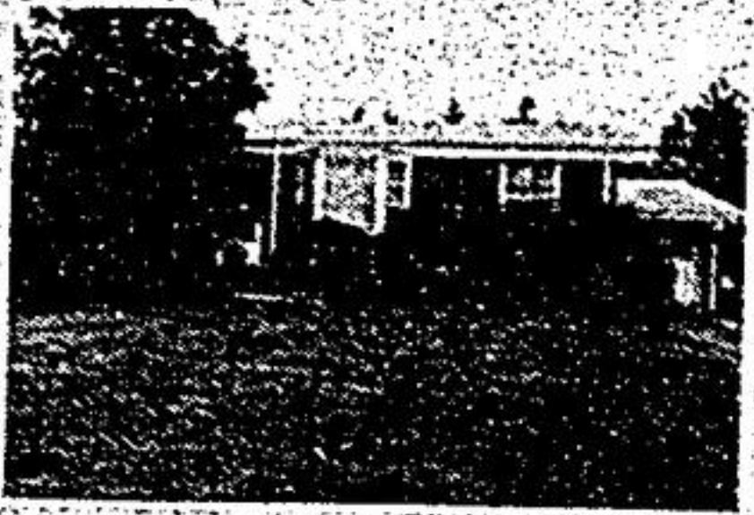
JUST REDUCED! MARKHAM BUNGALOW - PARK SETTING Enjoy privacy this summer in spacious 3 + 2 bedrm. home, separate dining rm., eat-in kit., hardwd. flrs., 90% fin. basement, 2 baths. Call Virginia Northcott 474-1710 or 294-1904.