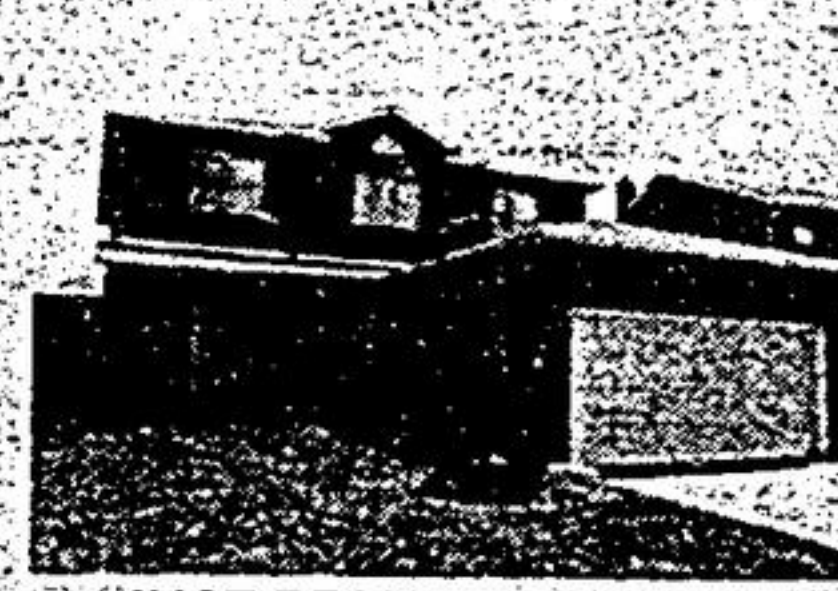
JUST REDUCED! LOVELY NEUTRAL HOME! MAIN FL. DEN! 2 storey, 4 beds. + 3 baths, main fl. fam. rm., den & laund rm., cent. vac, upgraded brdroom; fully fenced. Call Virginia Northcott 474-1710 or 294-1904.