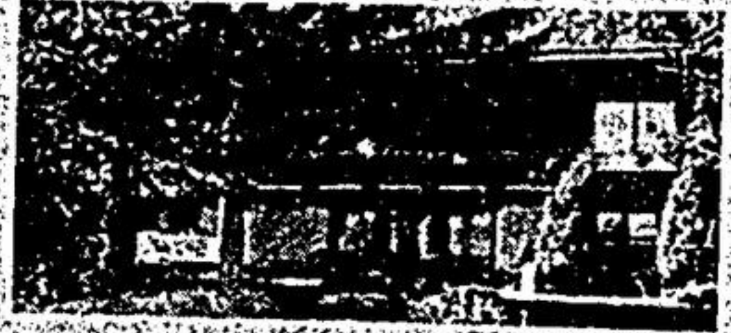
PRIME LOCATION - 2 ACRES 4 bdrm., 2000 sq. ft. bungalow, 3 washrooms, 2 stone fireplaces, walkout to deck. Public School and stores near by. ASKING $299,900.