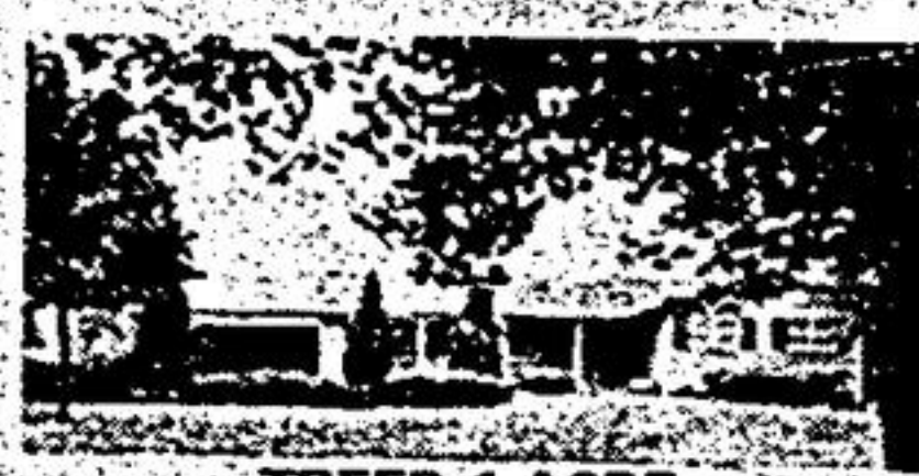
TREED 1 ACRE RANCH BUNGALOW Minutes to Markham in executive area, quiet location with room to breathe; cathedral ceiling; huge country kitchen. $359,000. Call Dorothy Mason 474-1710.