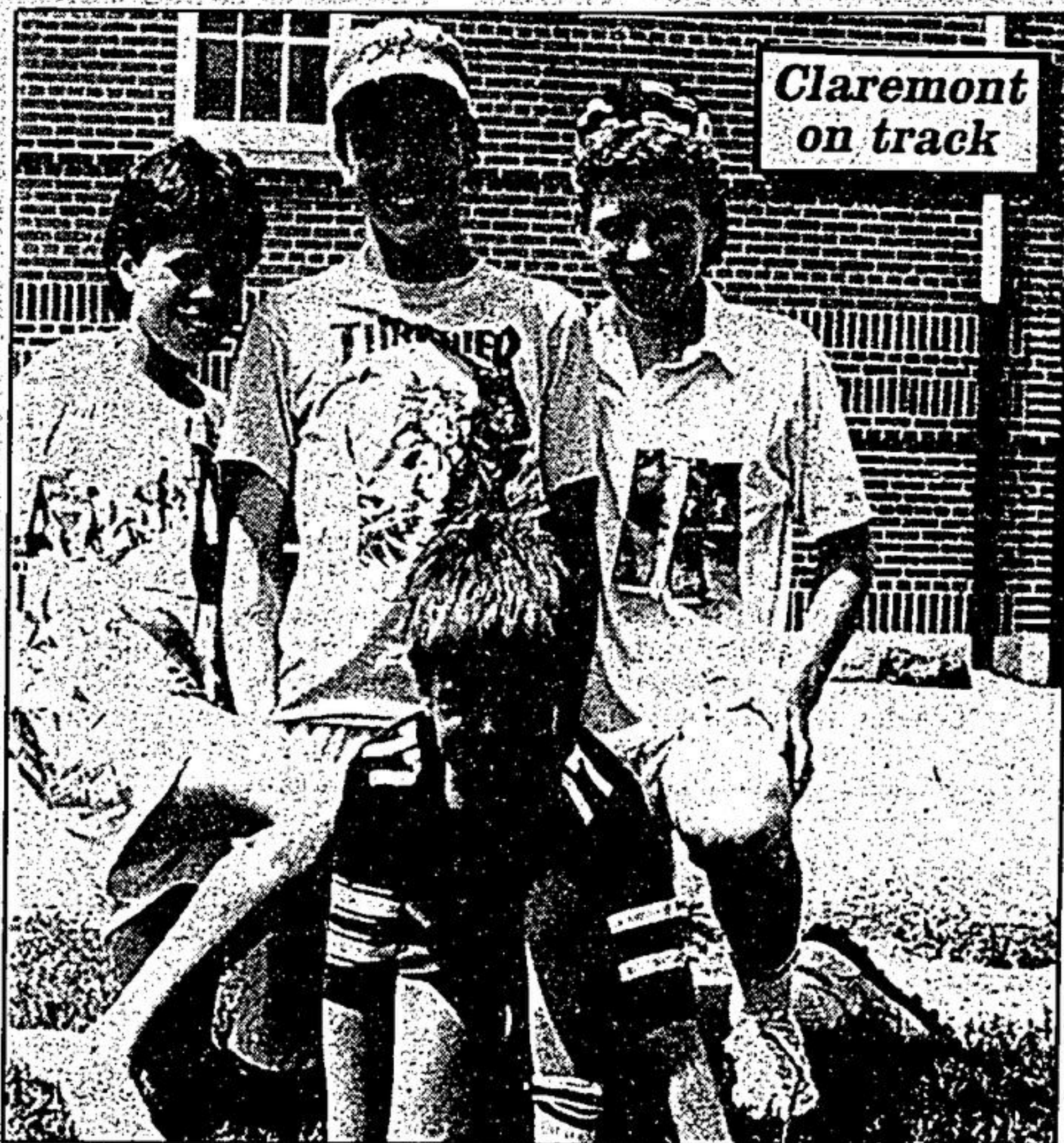
Claremont on track

According to the proposed draft, the Board's policy will ensure all elementary schools establish and maintain a safe arrival program; give parents the option of excluding their children from it; welcome parent volunteers, including such organizations as the Block Parent Group; and encourage parents, teachers and students to share in the responsibility of ensuring that everyone arrives safely at school each day.