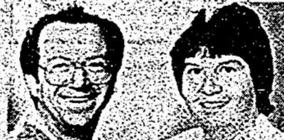
ROYDEN CROFT KAREN CROFT

Lovely 2 storey in Markham situated in a nice neighbourhood - Great for the kids! Has 4 bedrooms, main floor family room. Call Adele Gallo at 474-1212.