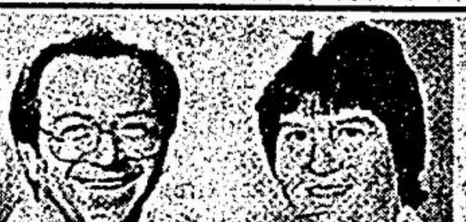
ROYDEN CROFT KAREN CROFT

For $134,900.00 own a detached home 3-4 miles north of the Town of Stouffville. 2 + 1 bedrooms, walkout to deck from kitchen, full finished basement. All appliances included. Call Sherry Hayes to view.