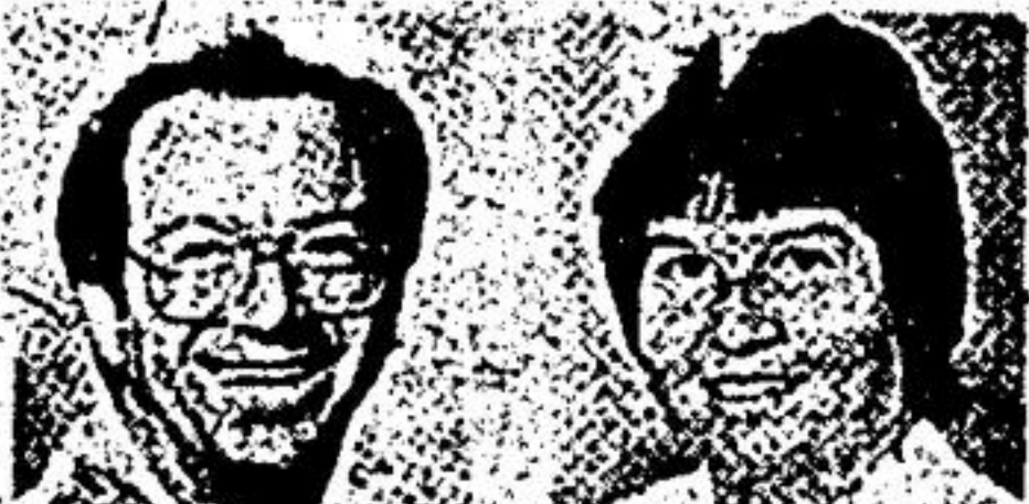
ROYDEN CROFT KAREN CROFT

Custom built 3 bedroom, 1860 sq. ft. brick bungalow. Main floor family room with french doors and fireplace, large country kitchen with loads of cupboards and walkout, separate sunken living room and dining room, full, unspoiled basement. All this + more on a 3/4 acre lot, backing onto open fields. Call Vikki Le Dez at 474-1212.