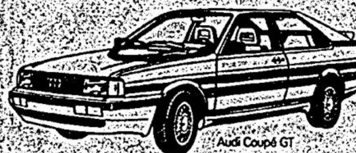
Audi Coupé GT