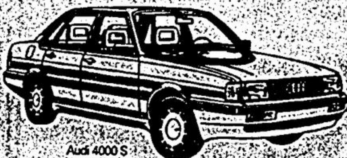
Audi 4000 S