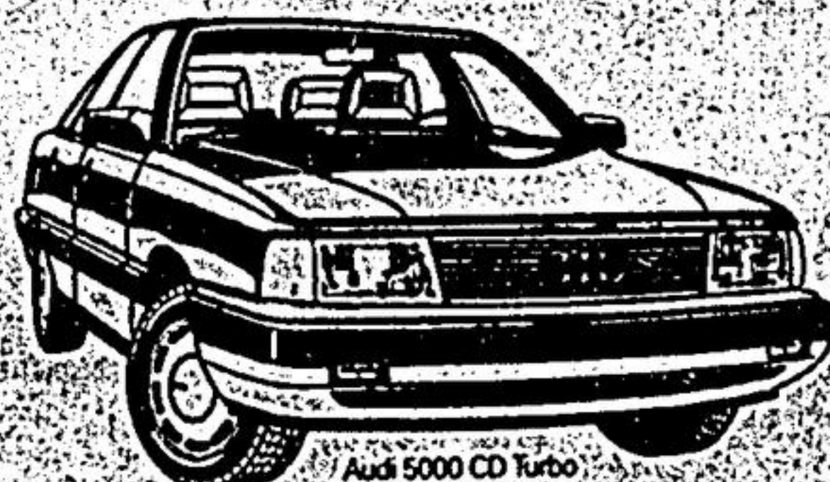
Audi 5000 CD Turbo

COME SEE AND DRIVE THE ULTIMATE IN HIGH PERFORMANCE — 16 VALVE SCIROCCO OR GTI —