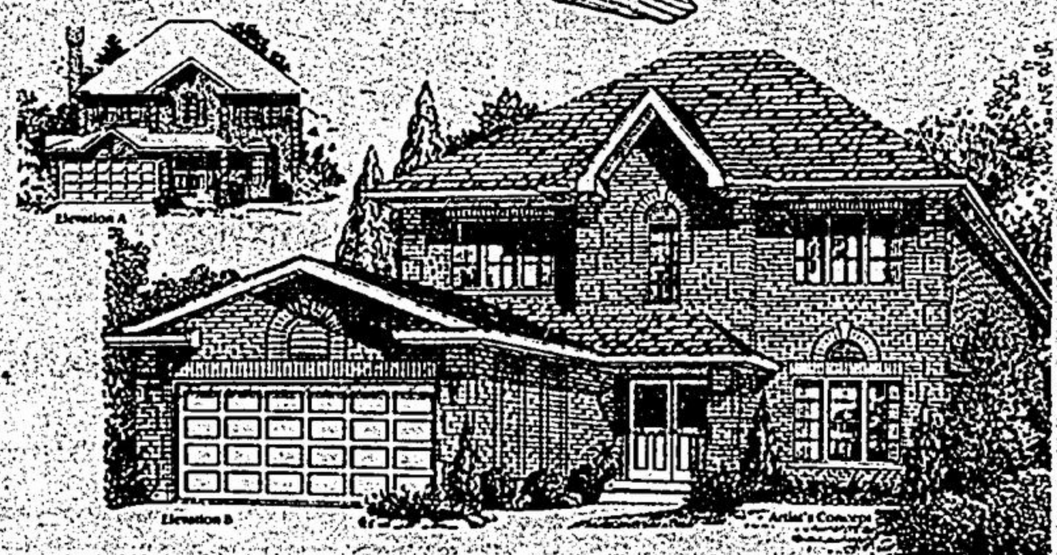
The Gable 3031 sq. ft.

Presenting Celebrity Place, an enclave of custom crafted homes ranging in size from 2313 sq. ft. to 3031 sq. ft. Located in the town of Markham. Standard features include all clay brick exteriors, ceramic entry, ensuites with raised roman baths, separate shower, custom flooring, crafted cabinets and much more. Lots up to 60 feet in width, up to 141 feet deep, many on a private cul de sac all at no extra cost. Combine this luxury with a location that has all the amenities your family deserves and you've got an opportunity not to be missed. With prices starting at $264,990 this is truly value that cannot be beat.