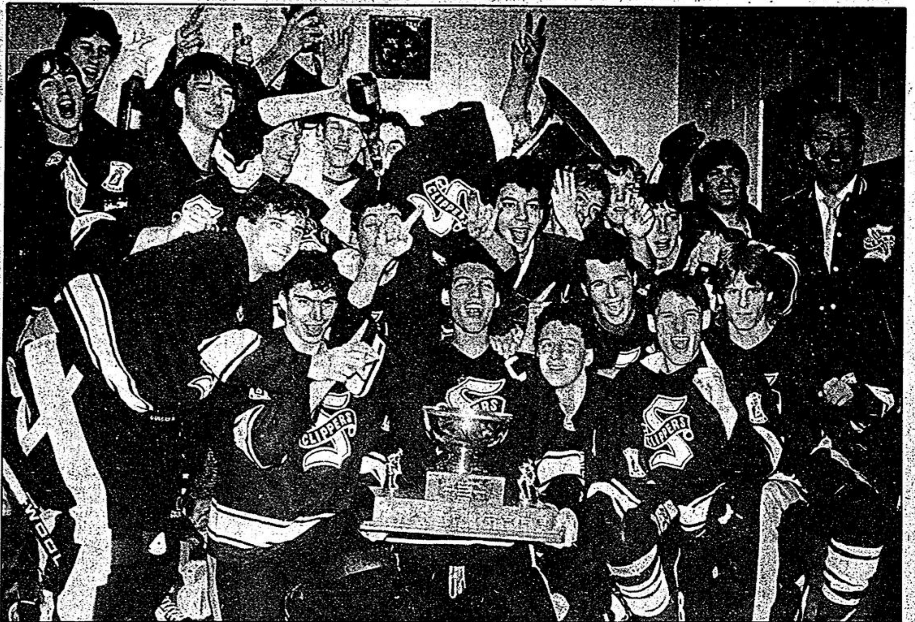
The 1987 Stouffville Midget Champions