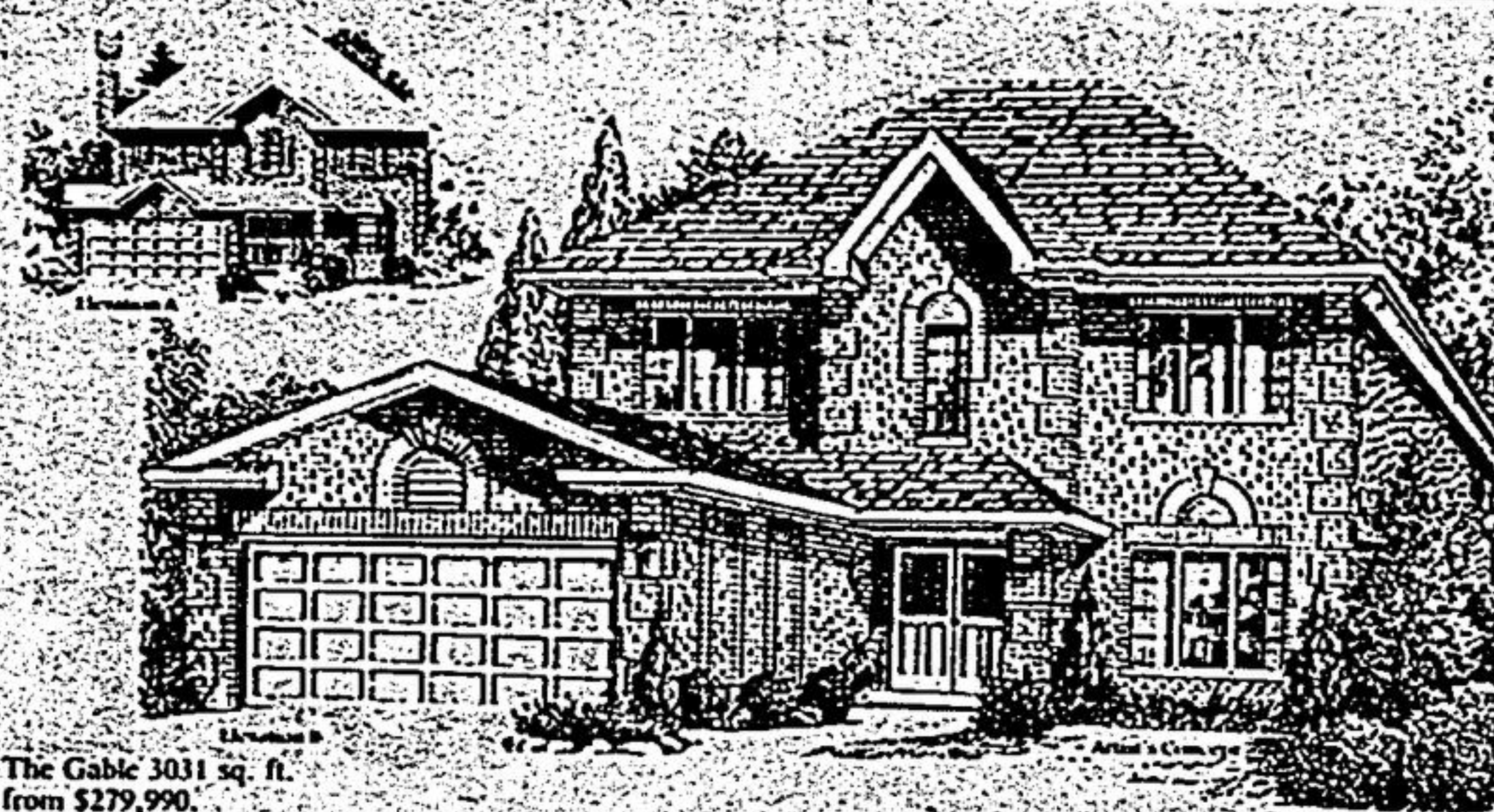
The Gable 3031 sq. ft. from $279,990.

Presenting Celebrity Place, an enclave of custom crafted homes located in the Town of Markham. Lots up to 60 feet in width, up to 190 feet deep, many on a private cul de sac. Homes range in size from 2313 sq. ft. to 3031 sq. ft., prices start at $249,990. Come and check out our silver star line up, the admission price will surprise you.