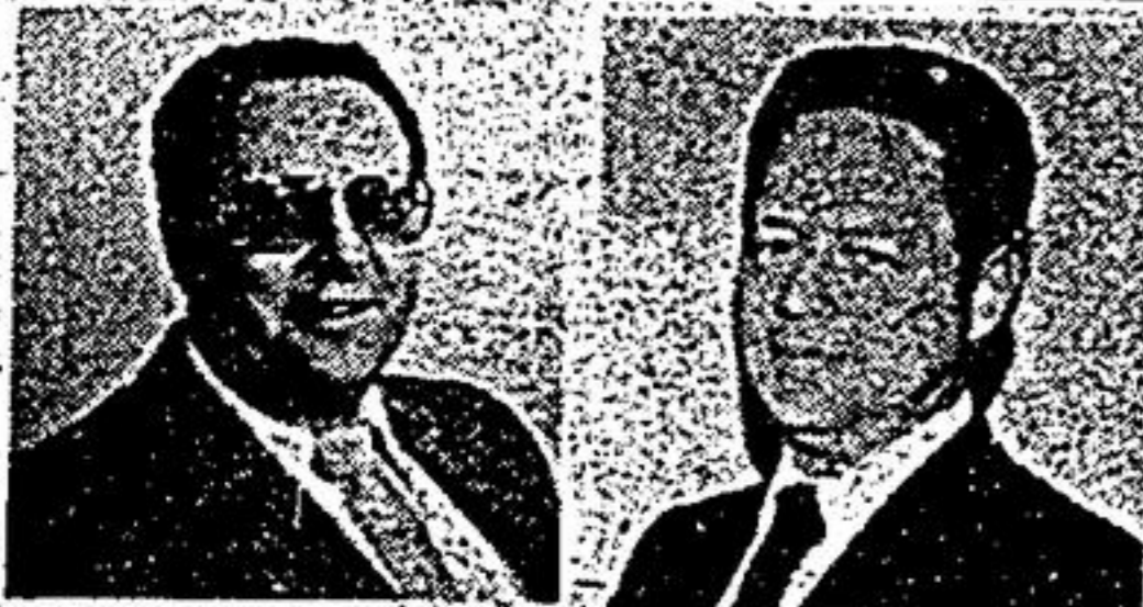
EARL ELSON ALAN ELSON

TOO GOOD TO BE TRUE!! Own a piece of the country close to the city. Imagine a detached split-entry bungalow featuring an eat-in kitchen, spacious living room and bedrooms. The finished basement has above ground windows rec room, laundry room, workshop and woodstove. Situated on a 50 x 125 lot backing onto open land on a dead end street just north of Bloomington in the Stouffville area. All this and more at a reduced price of $129,900.00. Call Sherry Hayes to view this property at 640-1200.