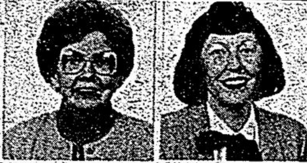
MARY STEWART ANN STUART

PRICE REDUCTION — $289,900.00 Owner anxious. 3,100 sq. ft. of luxury living, 3 baths, sunken family room, 3 walkouts, retreat off master bedroom, 2 decks, plus much more. Call Frances Fabbri at 474-1212.