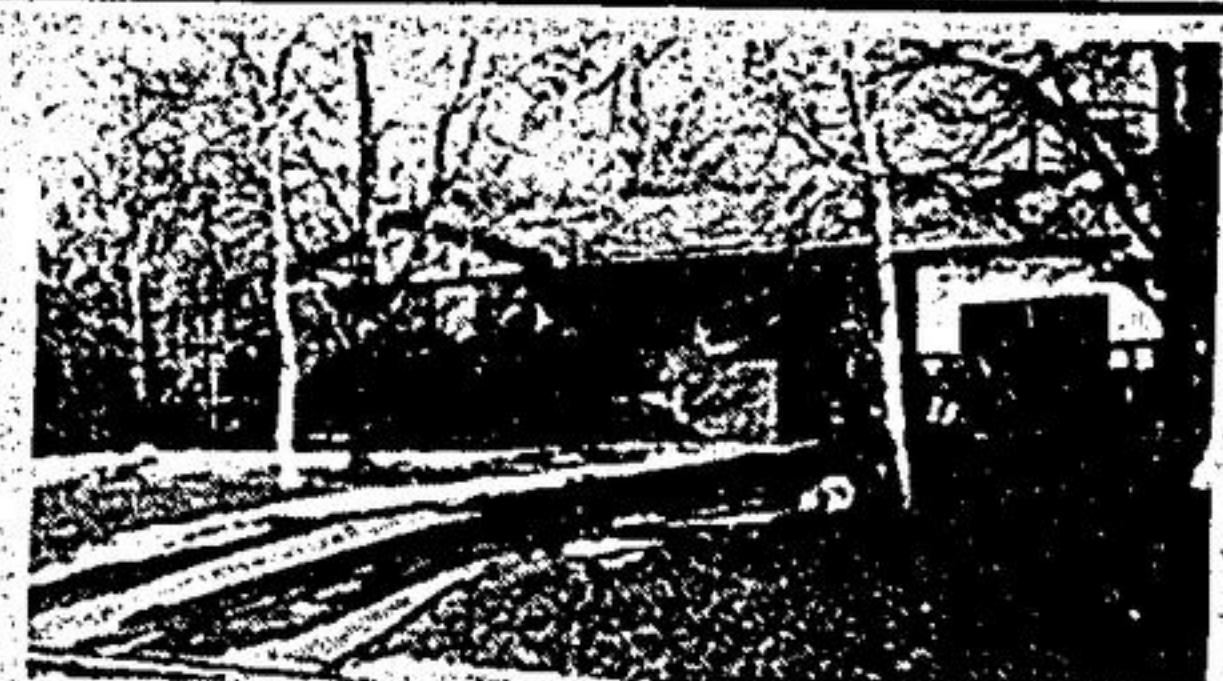
COUNTRY LIKE SETTING 5 MINUTES TO 404

Spacious bungalow with main floor family and fabulous lot $239,000. Call Diane Short or Lynda Keay, 298-3113.