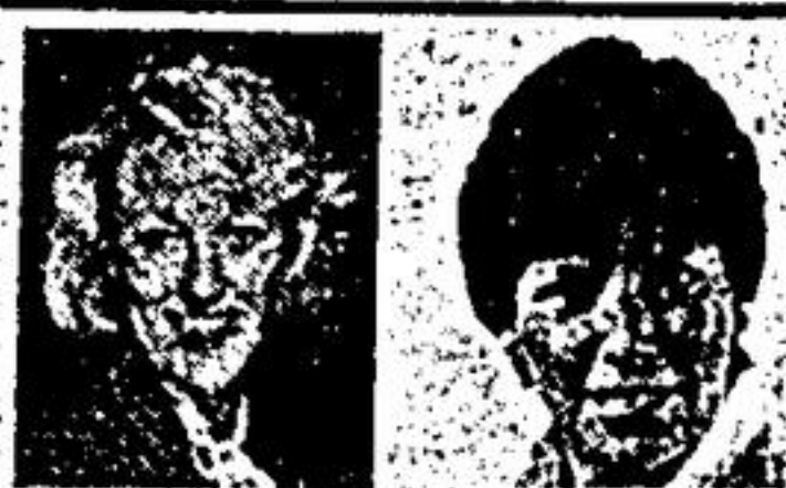
DIANE SHORT LYNDA KEAY

10 GORGEOUS acres with pond just north of Claremont. Easy access to 401. 3 bedroom brick bungalow. Ideal retirement property. Beautiful landscaping. Call Kathy Clulow today! 852-5142, res: 852-6106, 640-2600. Tor. Line.