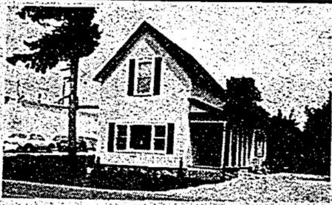
WHY PAY RENT?