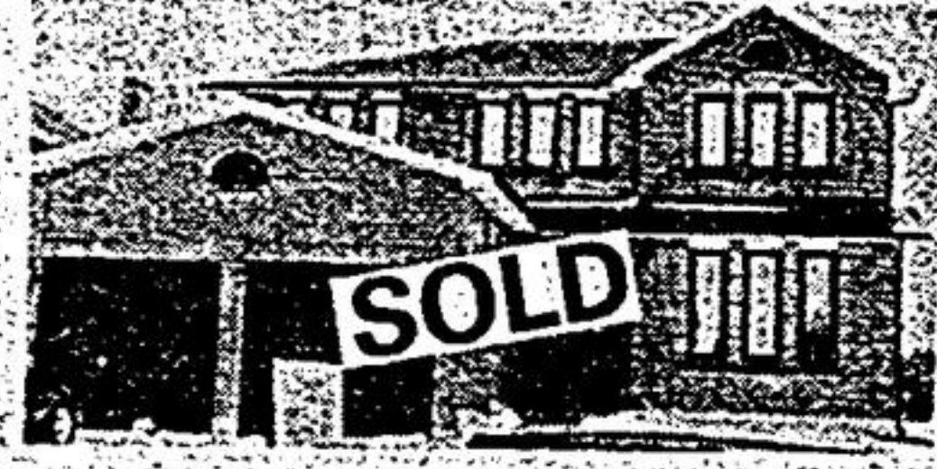
26 EDEN AVE. BRIMLEY & STEELES AVE. SOLD