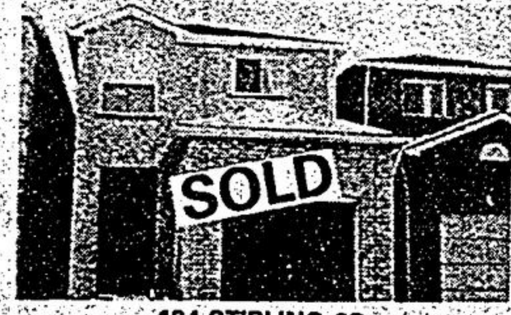
134 STIRLING CR. 1600 SQ. FT. SOLD VENDORS VERY HAPPY!