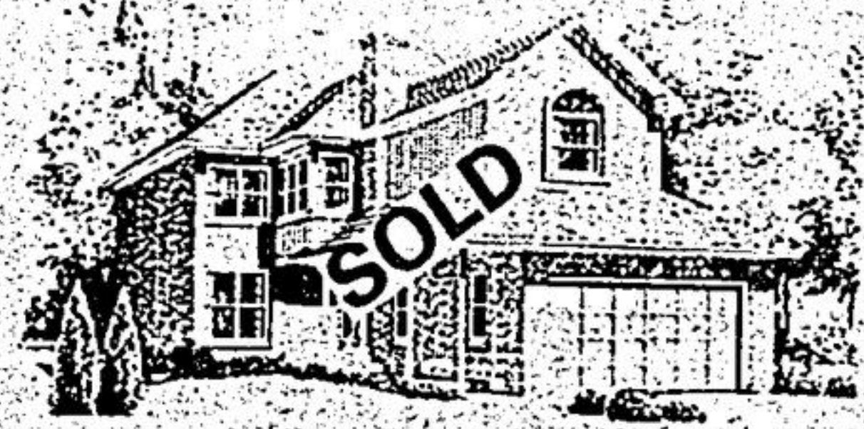
BRIDLE TRAIL UNIONVILLE SOLD IN 1 WEEK

RE/MAX Above the Crowd! RE/MAX MARKVILLE realty ltd. realtor 471-6600