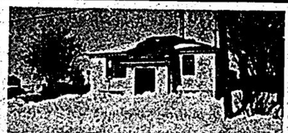
$132,900.00 AND DETACHED

GALLO REAL ESTATE LTD. REALTOR 474-1212 640-1200