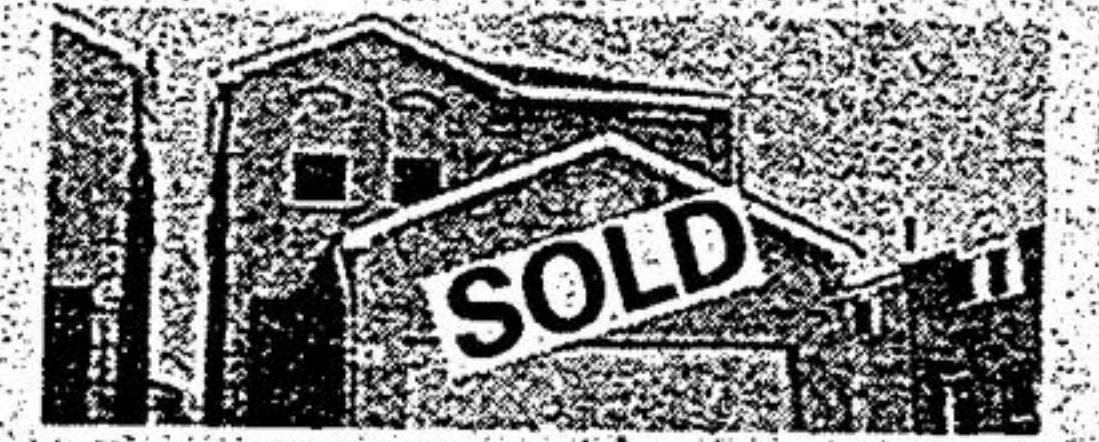
(KENNEDY & DENISON) 26 STATHER CRT 2,000 SQ. FT. SOLD IN 2 WEEKS