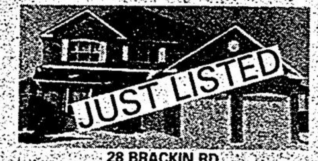
28 BRACKIN RD. IN PRESTIGIOUS MARKHAM KENNEDY & DENISON ST. $294,900 - a 3200 sq. ft. with pie-shaped premium lot! Features 4 large bedrooms, circular oak stairs to the basement, 3 baths, ceramics on main floor, main floor library, family room with fireplace, laundry + loads of extras. Call Amin Jadavji 497-2555.