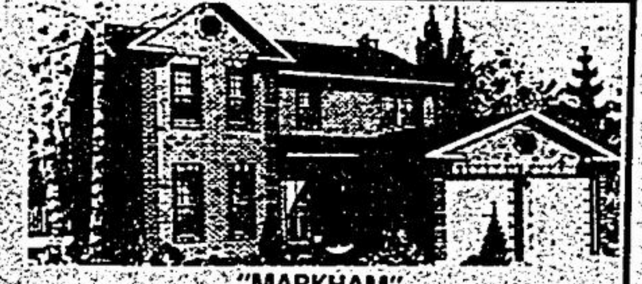
"MARKHAM" COSTAIN BUILT

RE/MAX Above the Crowd! RE/MAX MARKVILLE realty ltd. realtor 471-6600