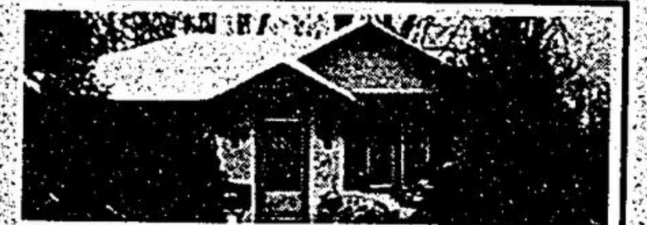
$139,900.00 - DETACHED!

GALLO REAL ESTATE LTD. REALTOR 474-1212 640-1200