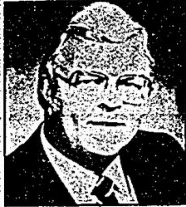
The Honourable John Crosbie Guest Speaker