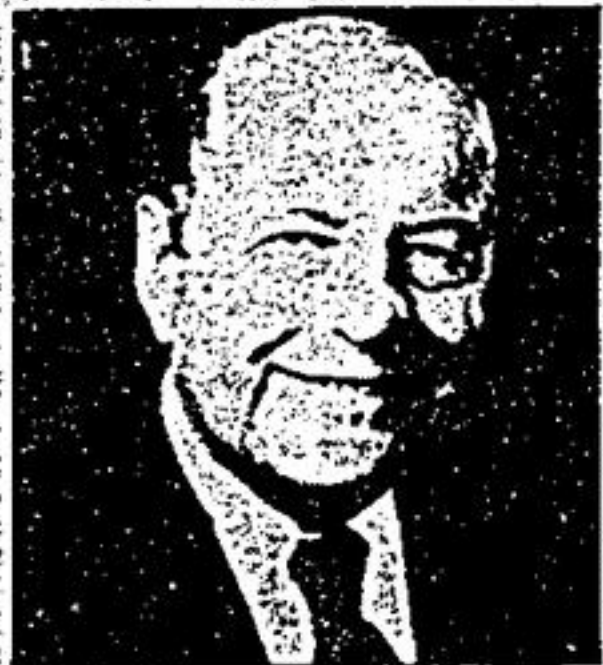
The Honourable Sinclair M. Stevens Spencer