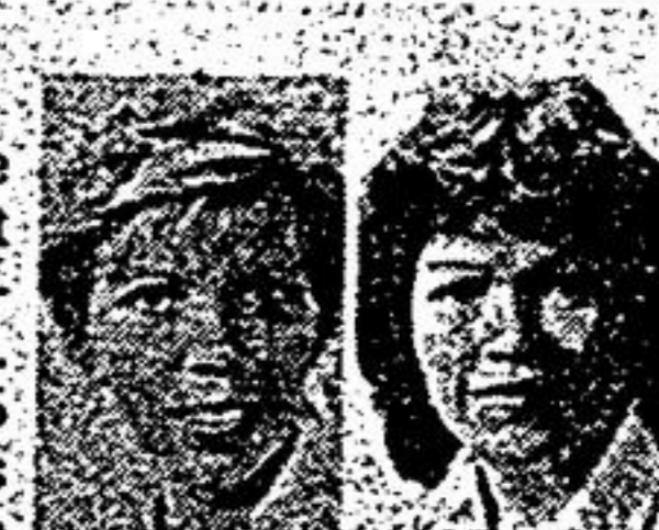
BO JENSEN DIANNE WOODCOCK

SOUGHT AFTER AREA A REAL CHARMER! Neutral 4 bedroom home situated on large lot. Bright eat-in kitchen with bay window & walk-out to backyard. Cozy sunken family room, 5 pc. ensuite to master plus much, much more, be the lucky buyer who gets this one. Call Now Bo Jensen/Dianne Woodcock 471-4900.