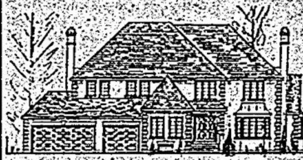
1 ACRE LOT — GOLF COURSE

COMMERCIAL ON MAIN C1 zoned property on Main St. Stouffville over 1/4 acre some rental income and plenty of potential for development Ian Batt. 640-4960. COTTAGE IN SUTTON On Cul-De-Sac with beach rights 3 bedrooms large living room winterized and renovated with severable lot. $84,900 Ian/Batt. 640-4960. HIGHWAY 48 FLORIST BUSINESS 282 Feet of frontage this property can be bought as a going concern at $379,000 or land and house only for $329,000. Call Ian Batt. 640-4960.