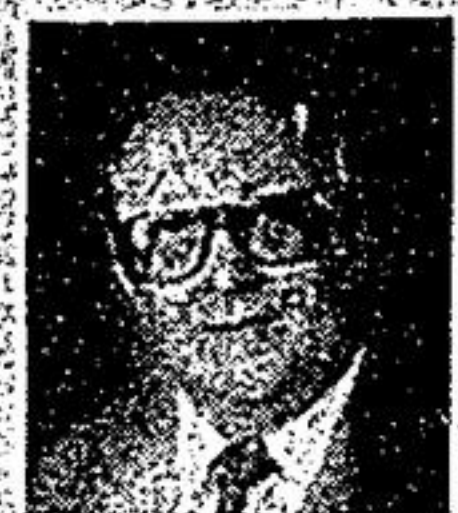
CHARLES DE BOURBON

Our beautiful model "The Maples" on the nicest lot in our small subdivision of estate homes is now seriously for sale. All bedrooms have ensuites. Fam. room and den on main floor. Big and beautiful McCowan N. of Bloomington. $385,000. Charles de Bourbon, 471-6600. Res. 640-4162.