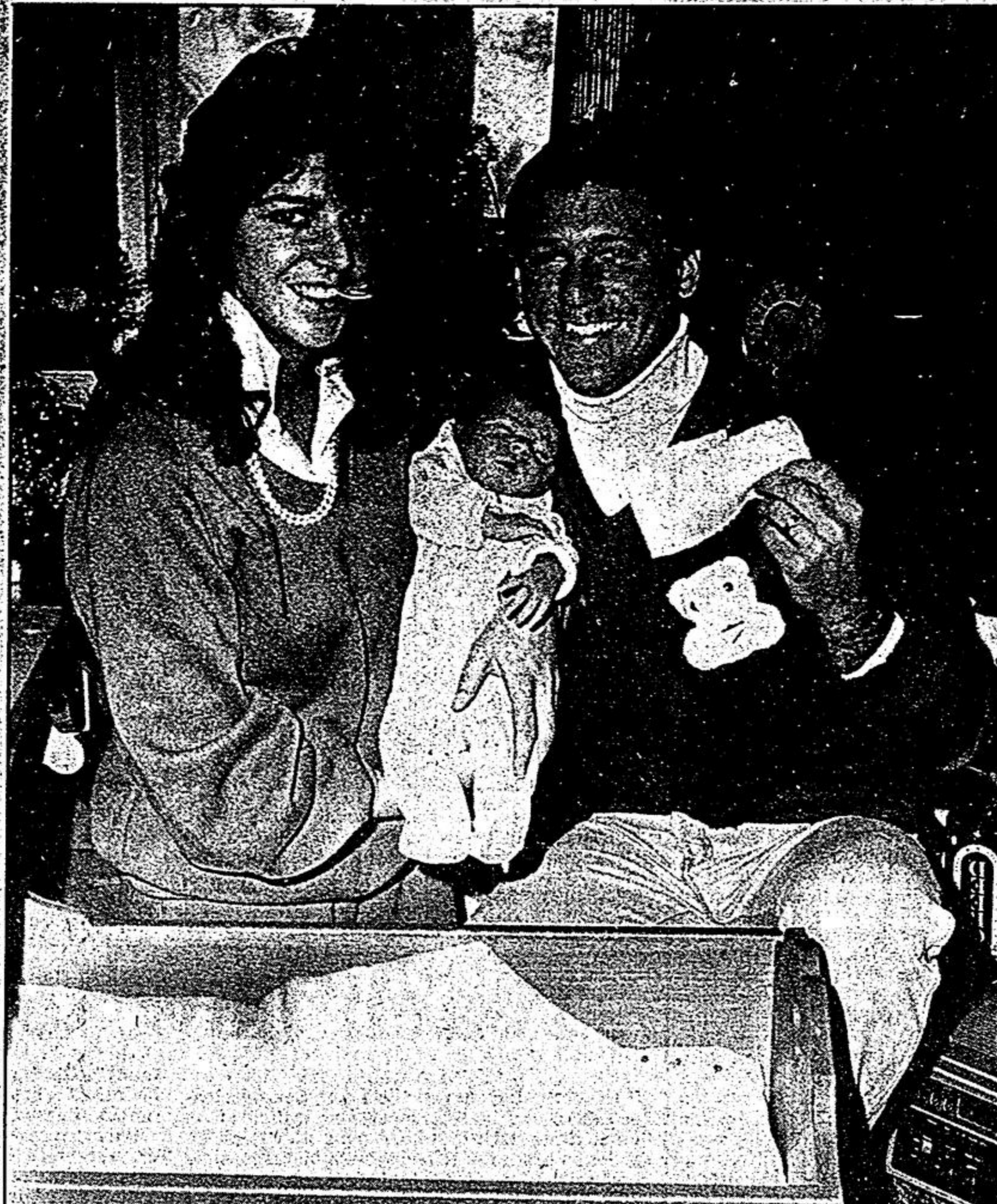
Not under the Christmas tree, but almost!