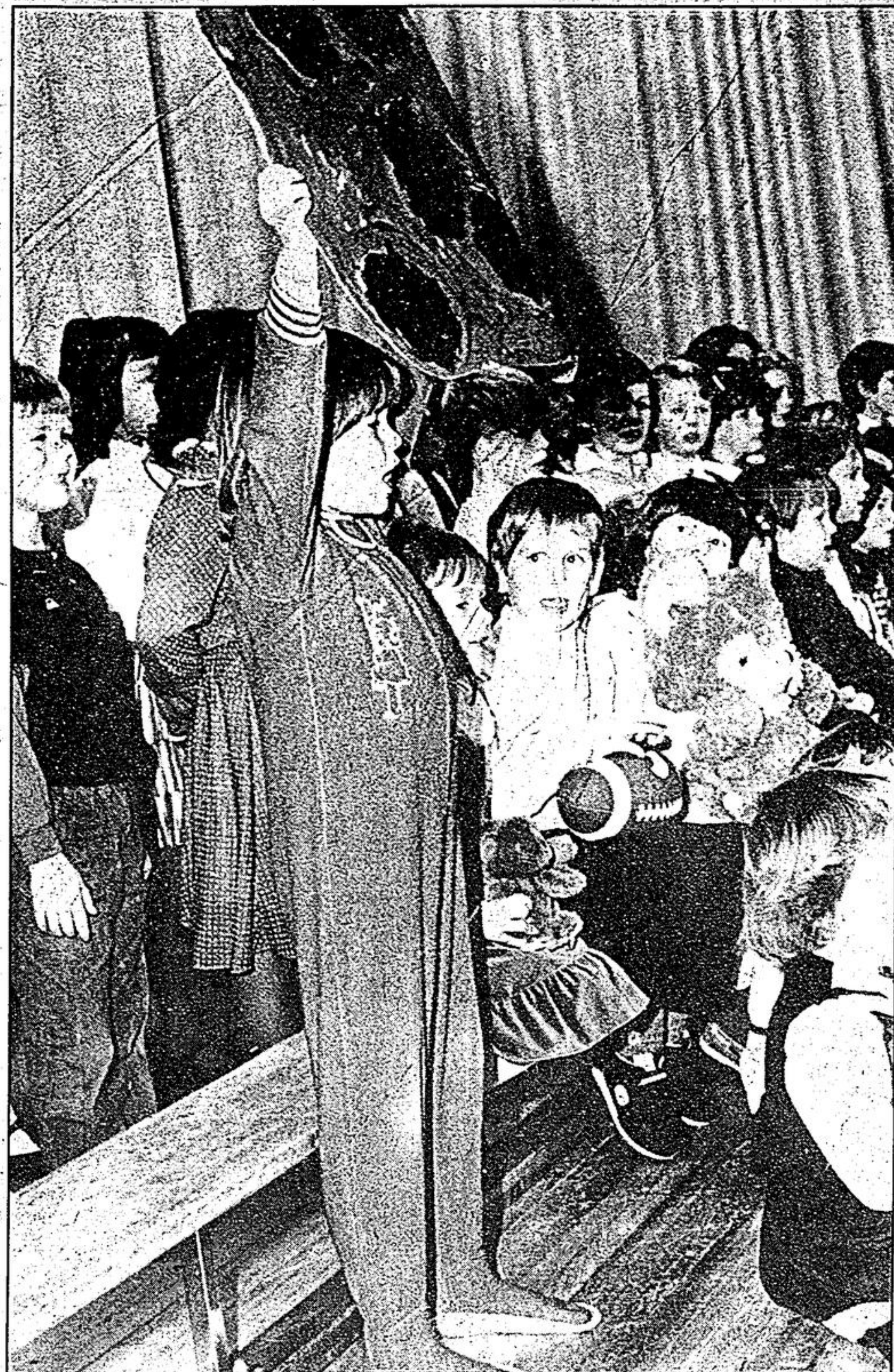
Twelve days of Christmas