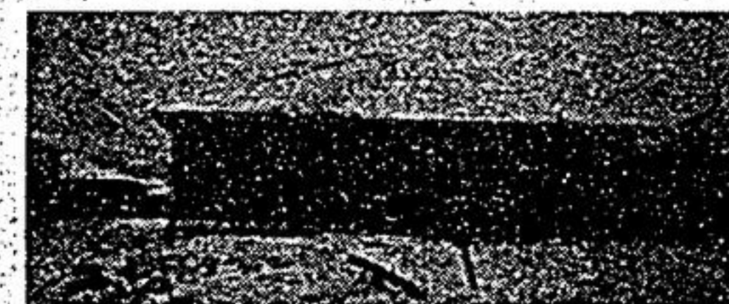
UXBRIDGE IN TOWN

SPLENDID VICTORIA UXBRIDGE Outstanding century home on large fenced lot. Custom decor, gleaming hardwood, extra wide trim & mouldings, formal dining, parlour & all the charm of yesterday. Heated 4 car garage & workshop. $199,900. Jeannine Sheridan 640-4151 or 640-4101.