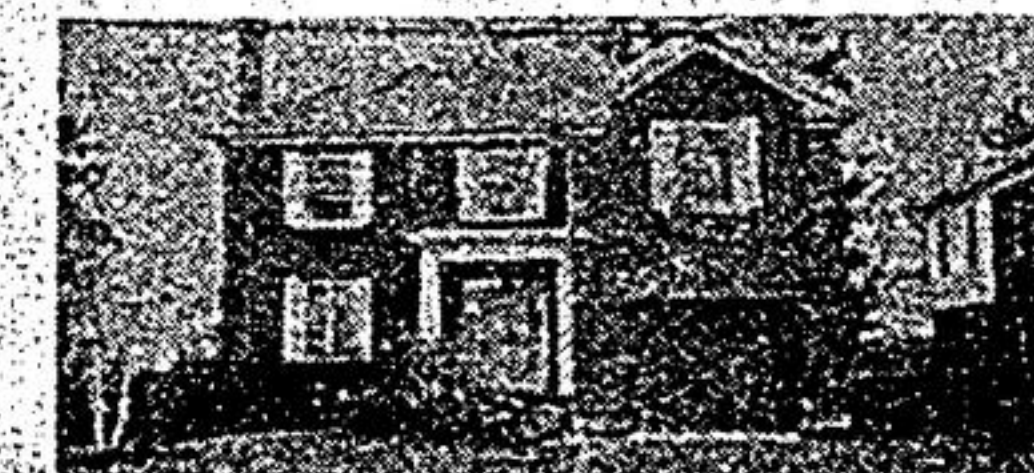
STATELY O'BRIEN AVE. STOUFFVILLE

Excellent starter, 3 bdrm. bungalow, finished rec. rm. & 4th bdrm., new wood siding, privacy fenced lot. Fenced $109,000. Bev Sefton 640-4151 or 473-3600.