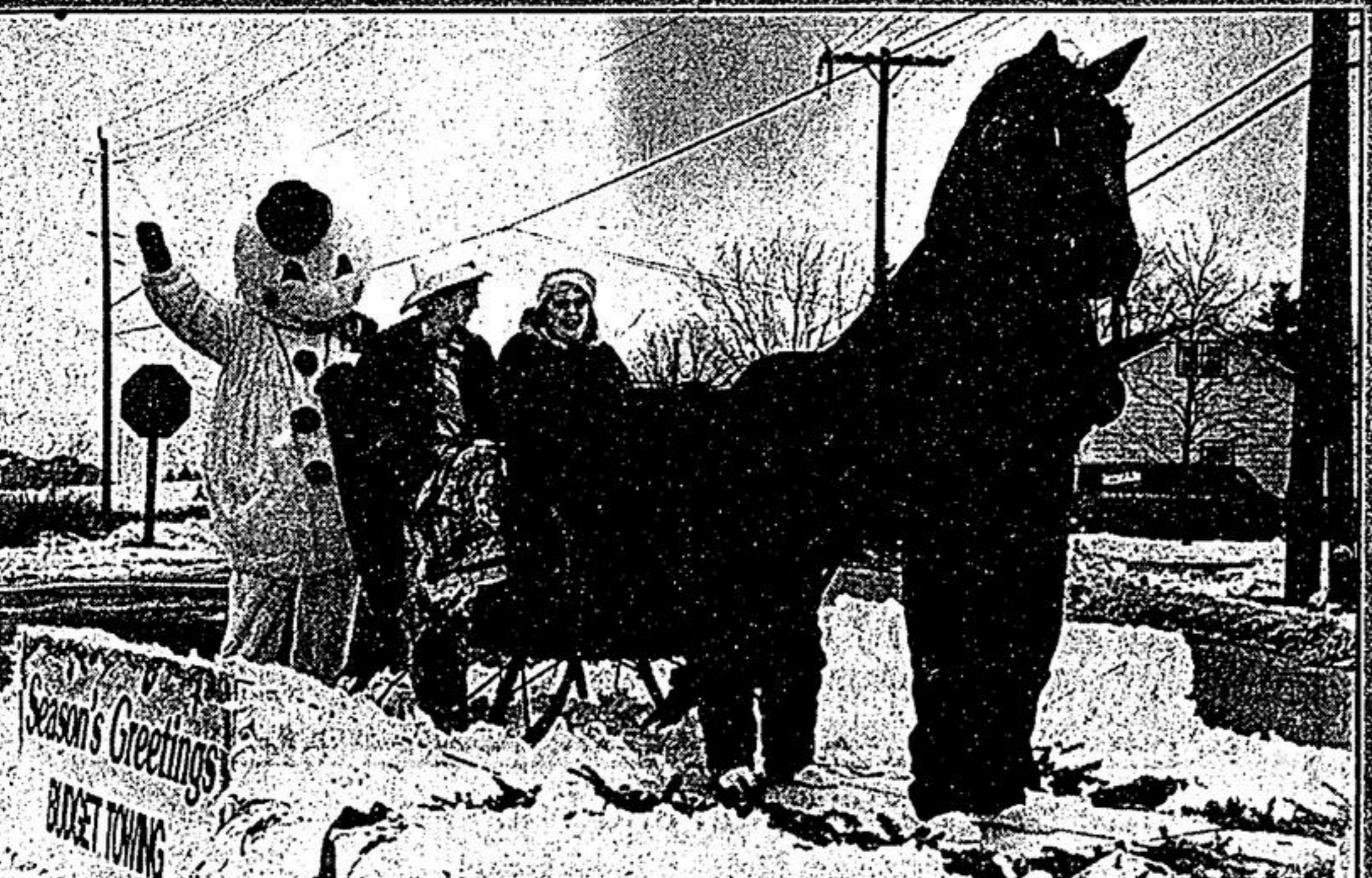
This float on a float entered by Budget Town, undoubtedly the warmest participants in the parade. —Jim Thomas