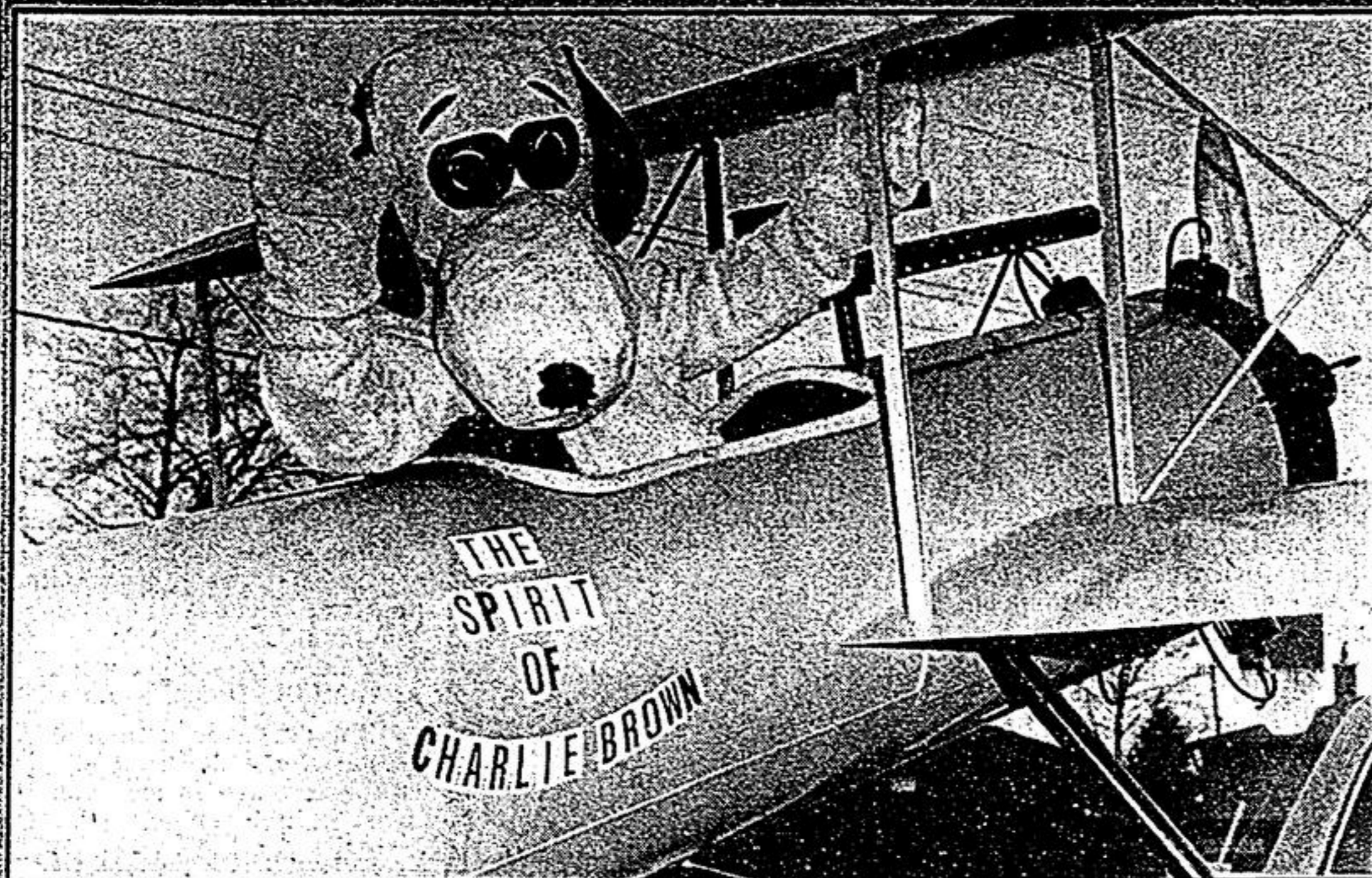
The Kin-sponsored Santa Claus Parade float of Charlie Brown flew home with 'The Most Original' award. It was entered by Glitsch Canada Limited.