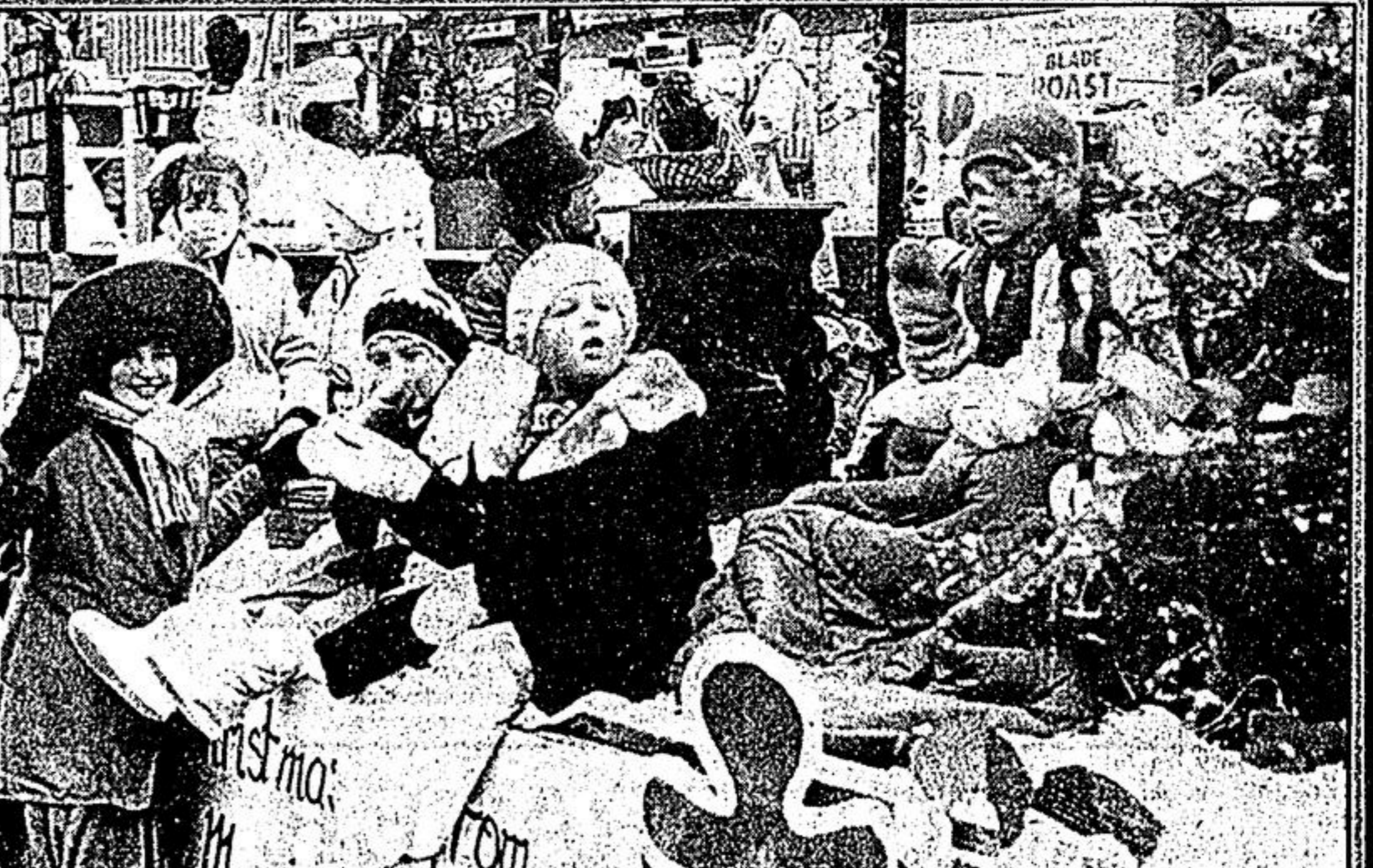
St. Mark's of Stouffville won the Best School Float award. The entry depicted Rowbotham's Store, a business recalled by many long-time Stouffville residents.