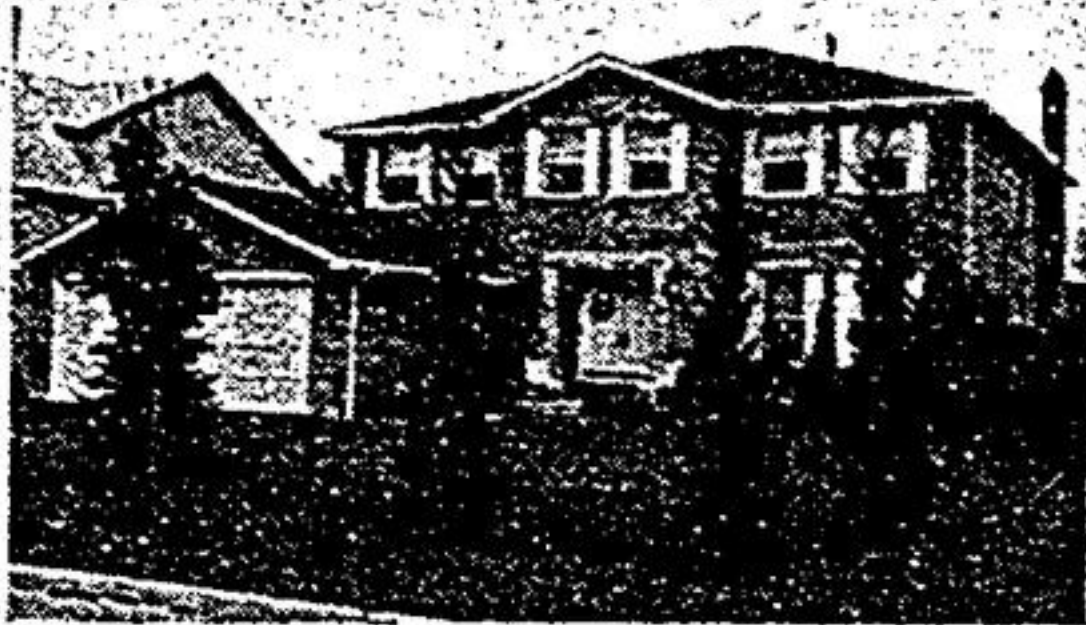
UNIONVILLE JUST REDUCED WALK TO TOOGOOD POND Fabulous house - Bramalea model, Dunvegan. 3,000 sq. ft., 4 bed., 3 bath, 68 foot frontage, pool, centre hall plan, central air, ideal street for children. Call Robert Cooper 474-1710, 841-0271.