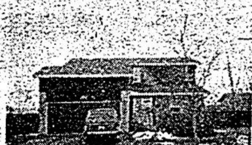
CHARMING 4 BEDROOM Popular area close to all amenities, finished basement, main floor basement with fireplace. Asking $159,900. Len Powell 640-4960. Re/Max Executive Realty Inc. Rltr.