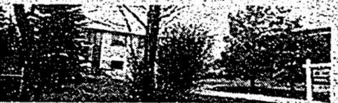
COUNTRY SETTINGS - 5 BDRM. BUNGALOW - 1/3 ACRE Raised bungalow on mature lot, panelled family rm. with fireplace, commuter's dream near Hwy. 404. Call Virginia Northcott 474-1710 or 294-1904.