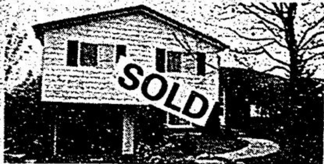
47 SIR BEDEVERE SOLD IN 2 DAYS! Asking $176,900. Call Virginia Northcott 474-1710, 294-1904.