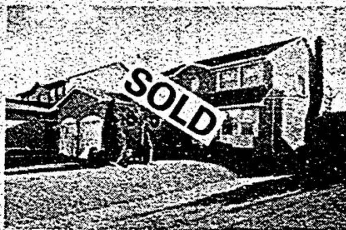
SOLD! 23 STONEHEDGE HOLLOW Asking $328,000. Call Rosemary Reid 474-1710, 640-7987.