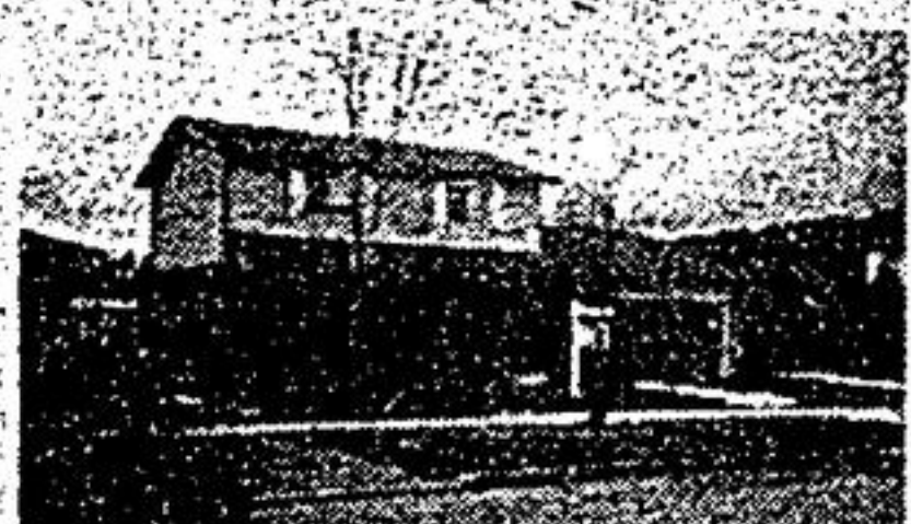
STOUFFVILLE Main floor family rm. with walk-out to covered deck, 4 bdrms., eat-in kit., broadloom throughout. $163,900. Mary Jean Sider 640-4960. Re/Max Executive Realty Inc. Rltr.