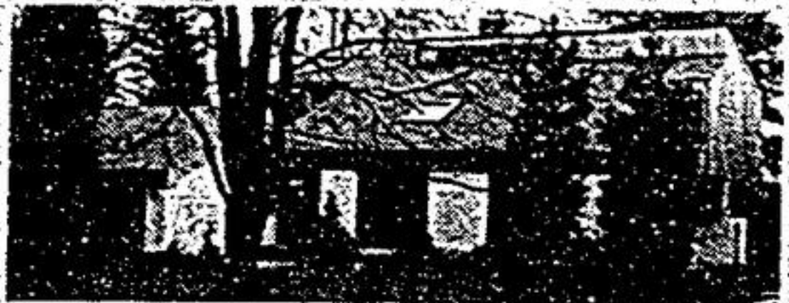
UNIONVILLE 2-STOREY CONTEMPORARY TREES GALORE - ON A RAVINE Backs onto Rouge River. Cathedral ceilings, skylights, sensational interior, 4 bed., 3 baths, main floor fam. rm., floor to ceiling fireplace, gourmet kitchen, loaded with upgrades. This is the lot you've been waiting for. Call Robert Cooper 474-1710, 841-0271.