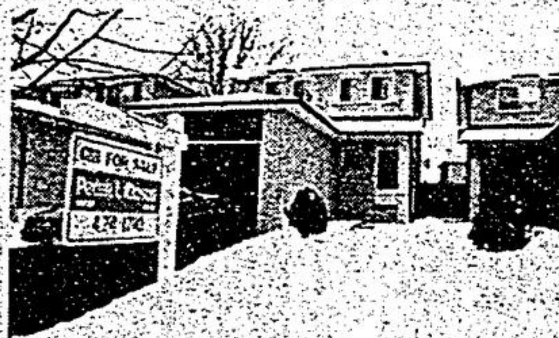
JUST LISTED! Super 3 bedroom, 1 1/2 baths, finished lower level, park near by. Robert Leadbeater 474-1710, 883-9456.