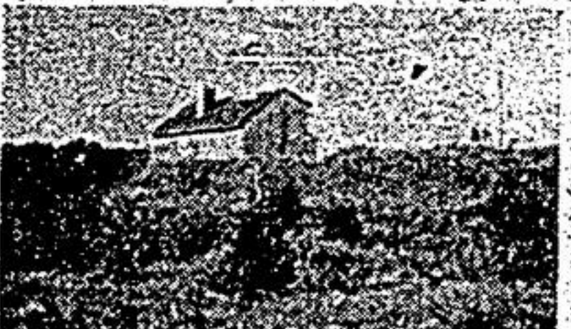
INDOOR ARENA + 25 STALLS 5 min. from Stouffville on 30 acres. Solid 2 storey, 3 Bd. house, cathedral ceilings, gorgeous view for miles. $285,000. Hank DeGroot 640-3948, 640-4960. Re/Max Executive Realty Inc. Rltr.