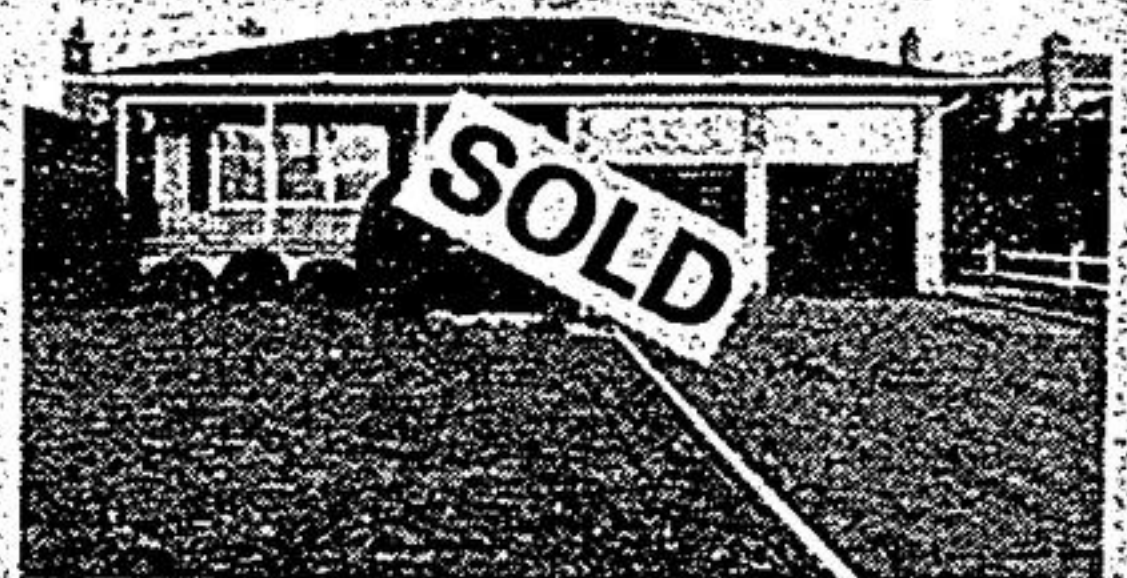
SOLD 146 FITZGERALD AVE. RECORD BREAKING PRICE On the market less than 1 month. For further information call Robin Tinney 474-1710, 479-6502.