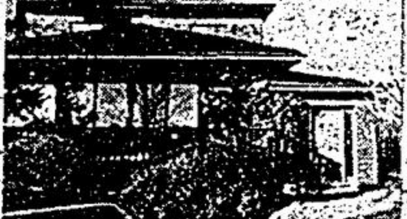
LARGE RURAL PROPERTY 3.06 ACRES Custom built home, 2800 sq. ft. 4 + 1 bedrooms, ceramic entrance, 3-4 pc. washrooms, large garden solarium. Property located minutes from downtown Markham. Melodie/Tim Shurgour, B: 471-6600, R: 294-2716. Re/Max markville realty ltd. rltr.