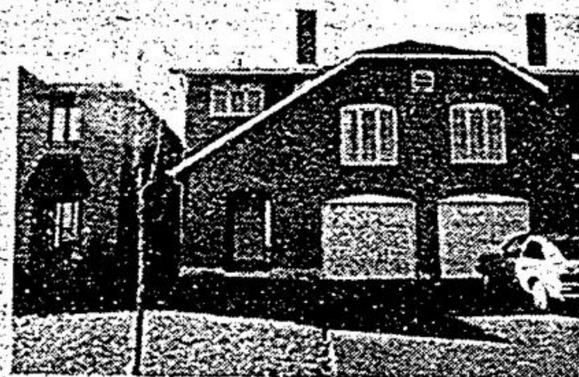
EXECUTIVE SEMI UNIONVILLE Featuring 3 bdrms., 3 baths, fam. room with fireplace, eat-in kitchen, cathedral ceilings, close to schools, buses, park, shops. Joyce Crix 474-1710, 477-6174.