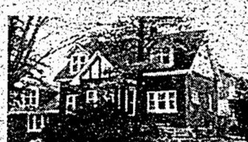
IMMEDIATE POSSESSION Charming 3 bedroom, 1 1/2 storey, on 99' x 75' lot in town, close to all amenities, main floor family room, fireplace. $189,900. Derek Thornton 640-4960. Re/Max Executive Realty Inc. Rltr.