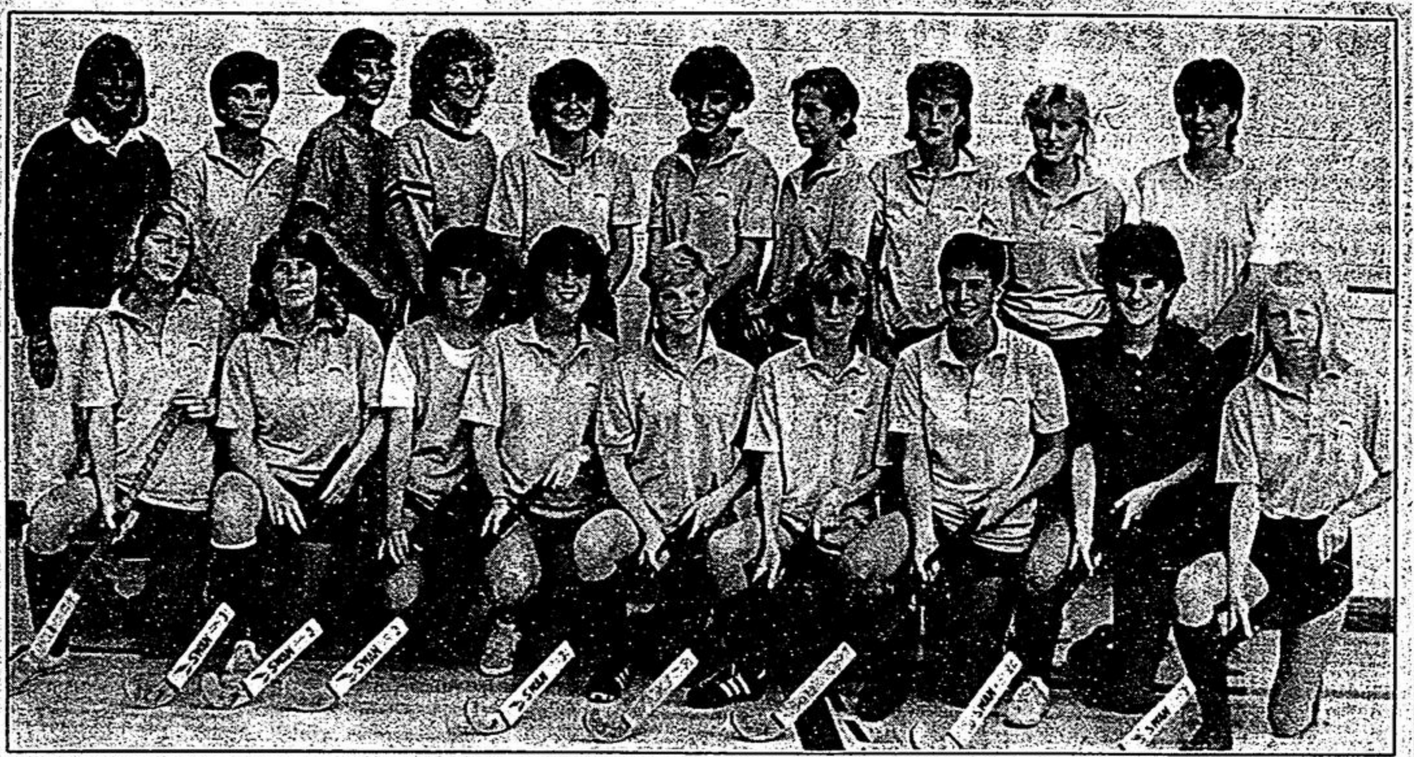
They played field hockey at SDSS in '86