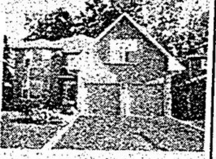
25 COLONEL BUTLER DR.

IDEAL COMBINATION! 3 year old home on 30 year old lot. Exquisite 4 bdrm. home on 150' treed lot. Double garage, privacy fence, charming eat-in kitchen with w/o to patio, over 3,000 sq. feet. $273,900. Carole McMaster.