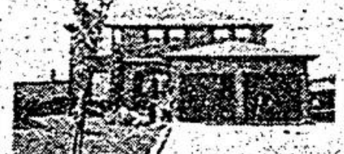
8 PATRIOT CT.

And more in this 3200 sq. ft. executive 2 storey on prime court. Den plus family room, retreat off master, central air, vac. plus many other features you will appreciate when you visit. Anne Cairns 471-4800