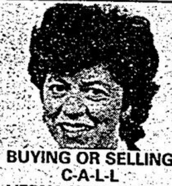
BUYING OR SELLING C-A-L-L VERNA HALLWORTH

TOWNHOUSE 2 storey — 3 bedroom — finished basement — 1 owner — excellent condition — mid-1987 occ. McCowan/Finch . . . $118,500. ***ASK FOR VERNA HALLWORTH*** Business 471-4800/Residence 477-3193