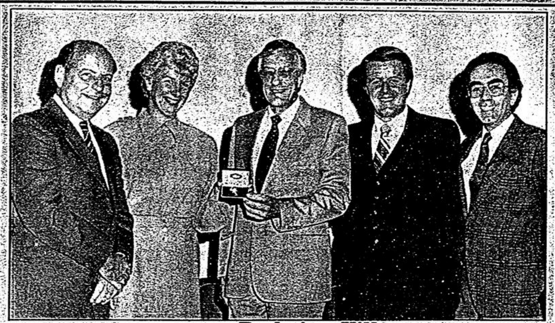
Important people at Parkview Village ceremony