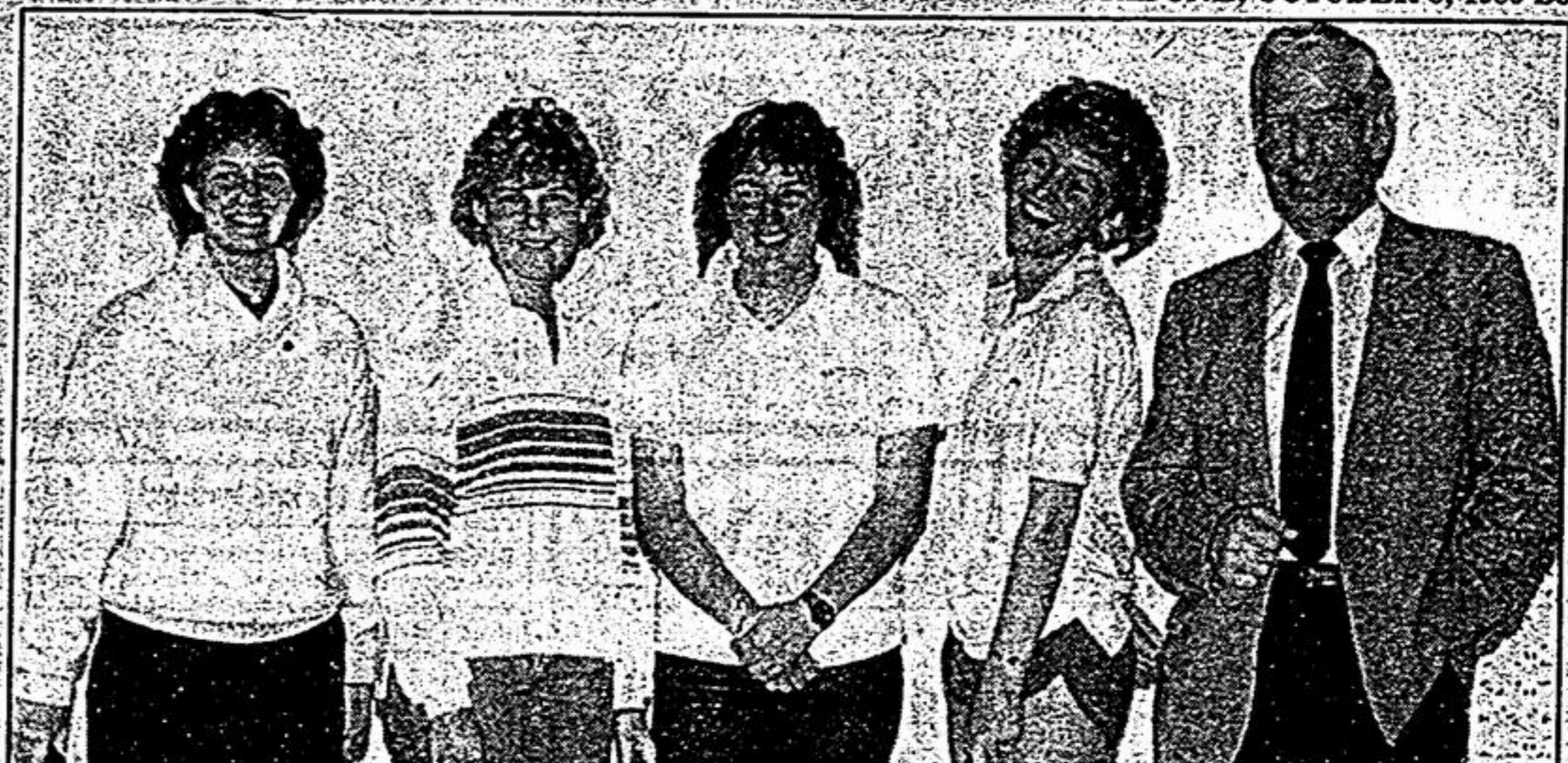
York Region golf champs