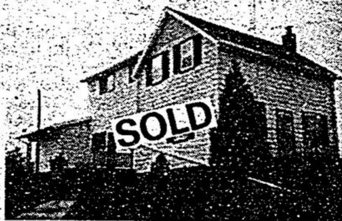
GOODWOOD HOBBY FARM 13 ACRES

Spacious 4 bdrm. stone & cedar, contemporary home, nestled on wooded land with pond. North of Uxbridge. Open concept design, 3 fireplaces, expansive decks & many walkouts. Reduced to $225,000. Jeannine Sheridan 640-4151 or 640-4101.