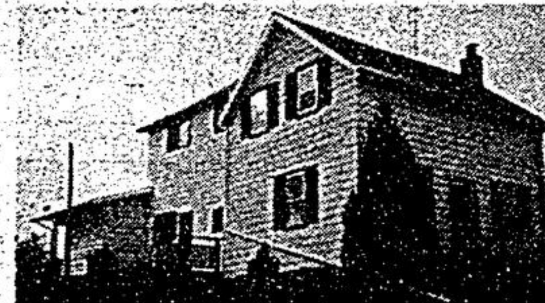
GOODWOOD HOBBY FARM

Come and see this nice bungalow on a large lot (almost an acre), just west of Stouffville. This home features large living room with stone fireplace, eat-in kitchen, hardwood floors, 3 bedrooms, main floor laundry, 2 large decks, 2 car garage, a pleasure to show. Ruth Dick 640-4151 or 852-3592.