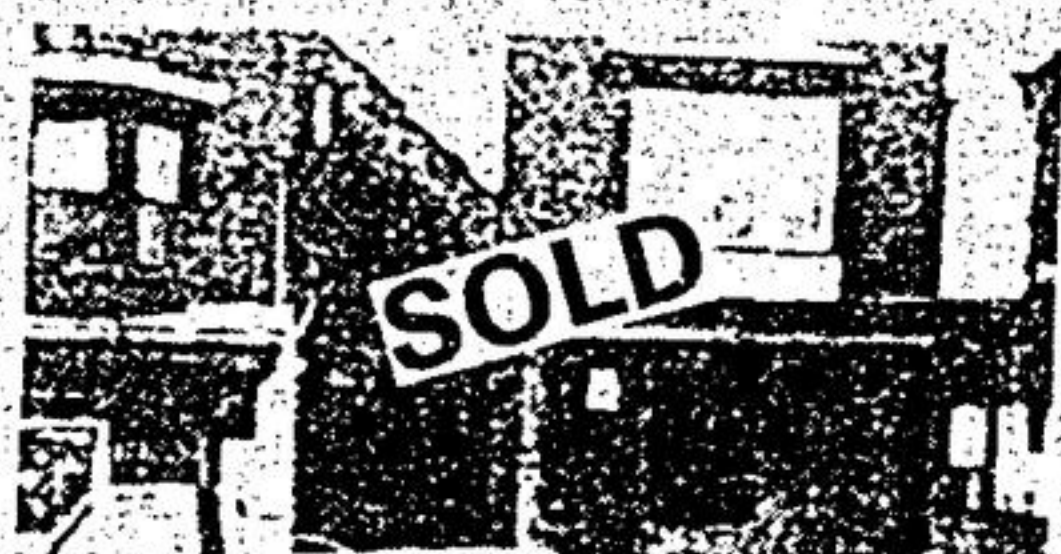
NEWLY RENOVATED TRIPLEX

Well located, excellent condition. Good investment for the right individual. Call for information. Paul Reynolds 485-7766