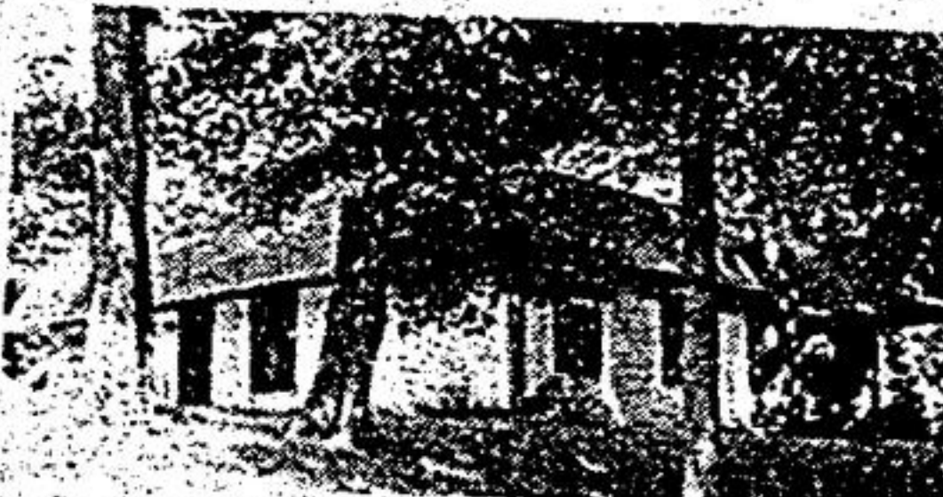
COUNTRY HIDEAWAY + KENNEL

114 Main Street West, Stouffville, Ontario L0H 1L0 "SERVING OUR COMMUNITY SINCE 1956"