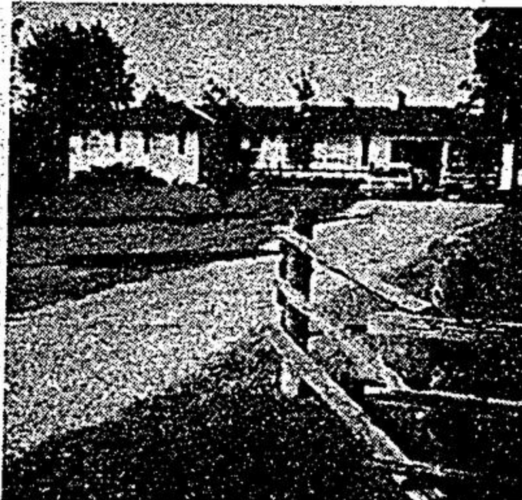
TIRED OF A SUBDIVISION

5 acres. Barn, separate hay bldg., paddock, 2500 sq. ft. bungalow has good space for in-law suite. 5 bdrm., 2 family rms., 2 baths. Asking $274,900. Bev Sefton 640-4151 or 852-5132.