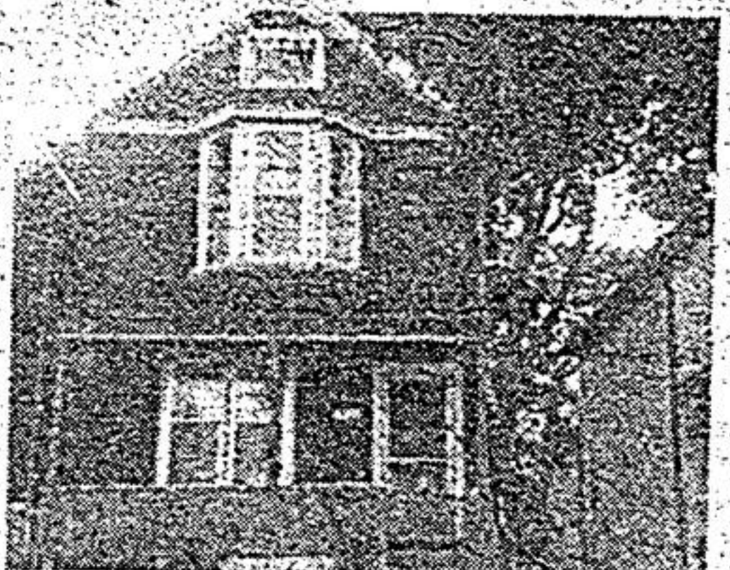
NEW LISTING COXWELL/DANFORTH

3 Bedrooms, main floor master bedroom, cathedral ceilings, 2 storey fireplace, 2 walk-outs to deck. A must to see. Paul Reynolds 485-7766