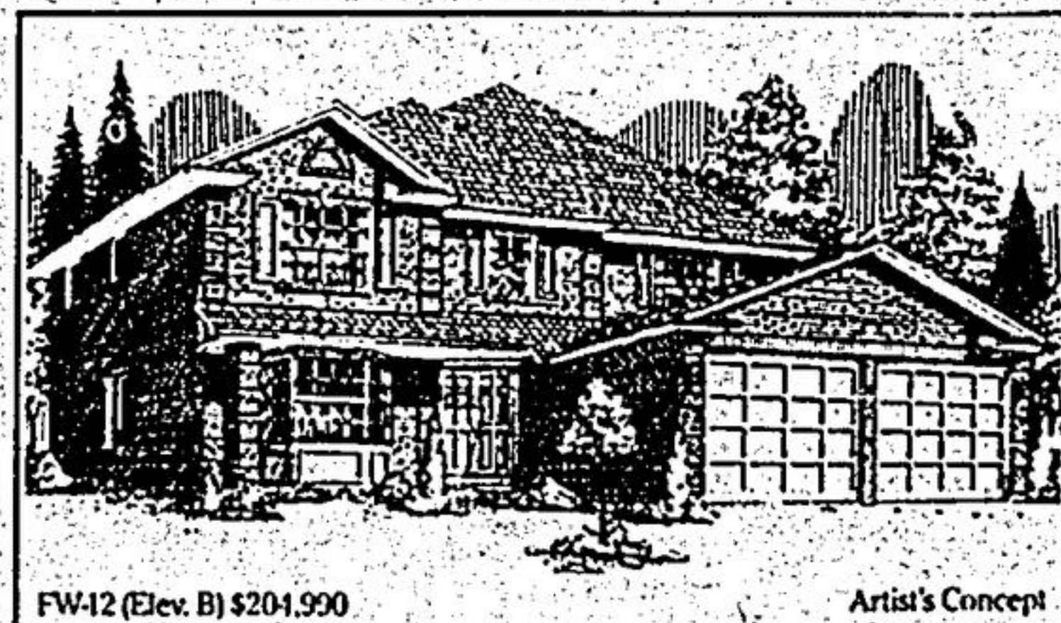
FW-12 (Elev. B) $204,990

Walk-Outs, Cul-de-Sacs & 150' Deep Lots Available