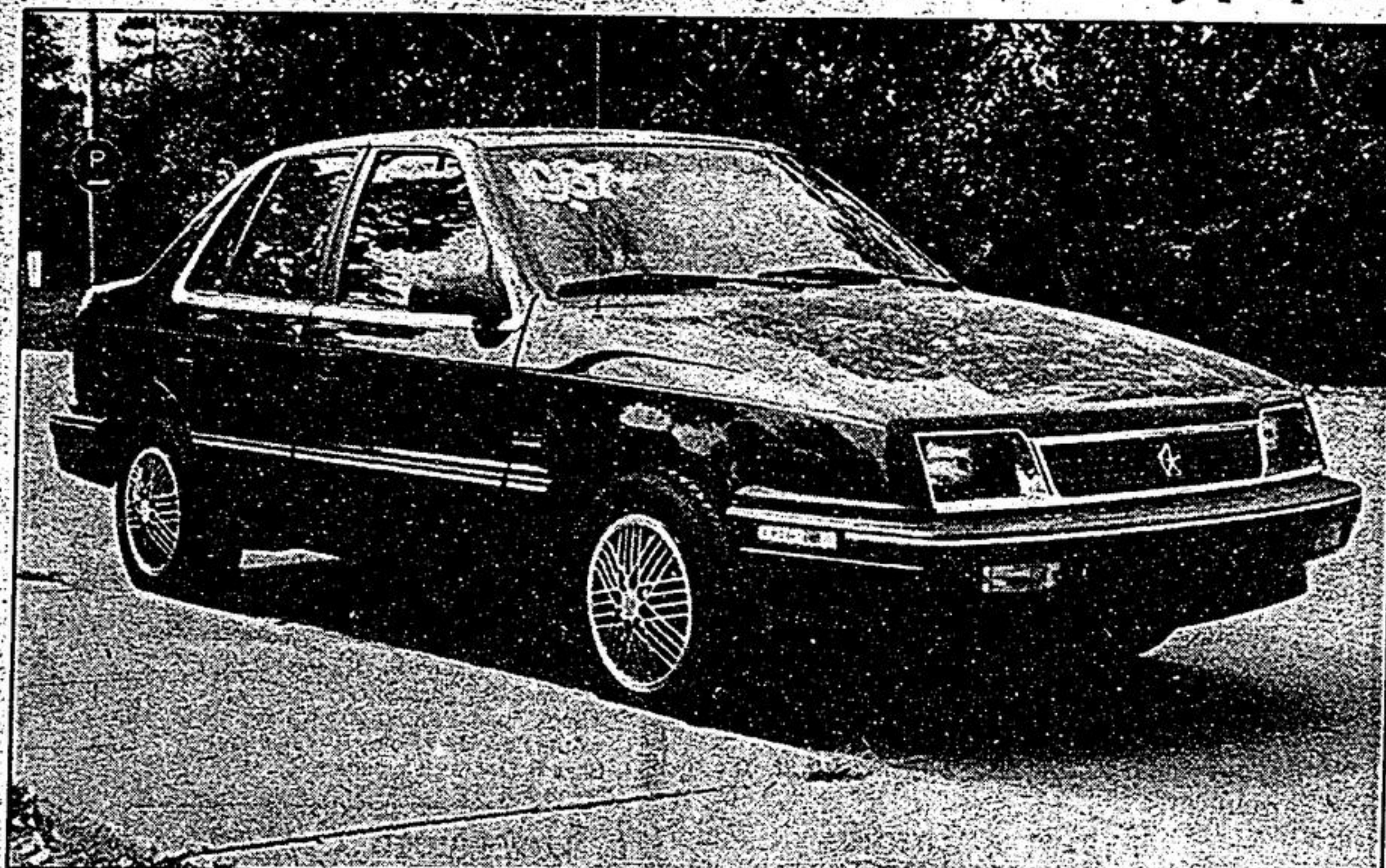
Chrysler's Sundance may not have all the traditional LeBaron luxury items, but it is a solid, unpretentious car with clean lines. It gives great performance; is fun to drive, and the four-cylinder engine (below) also has a turbo package.

The Sundance was fun to drive and went exactly where it was pointed. The turbo comes with a