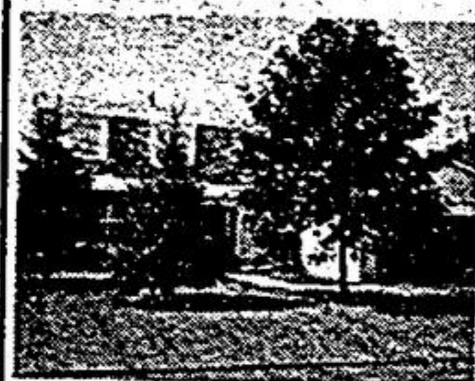
20 RAE CRES.

Royal LePage Real Estate Services Ltd. Realtor