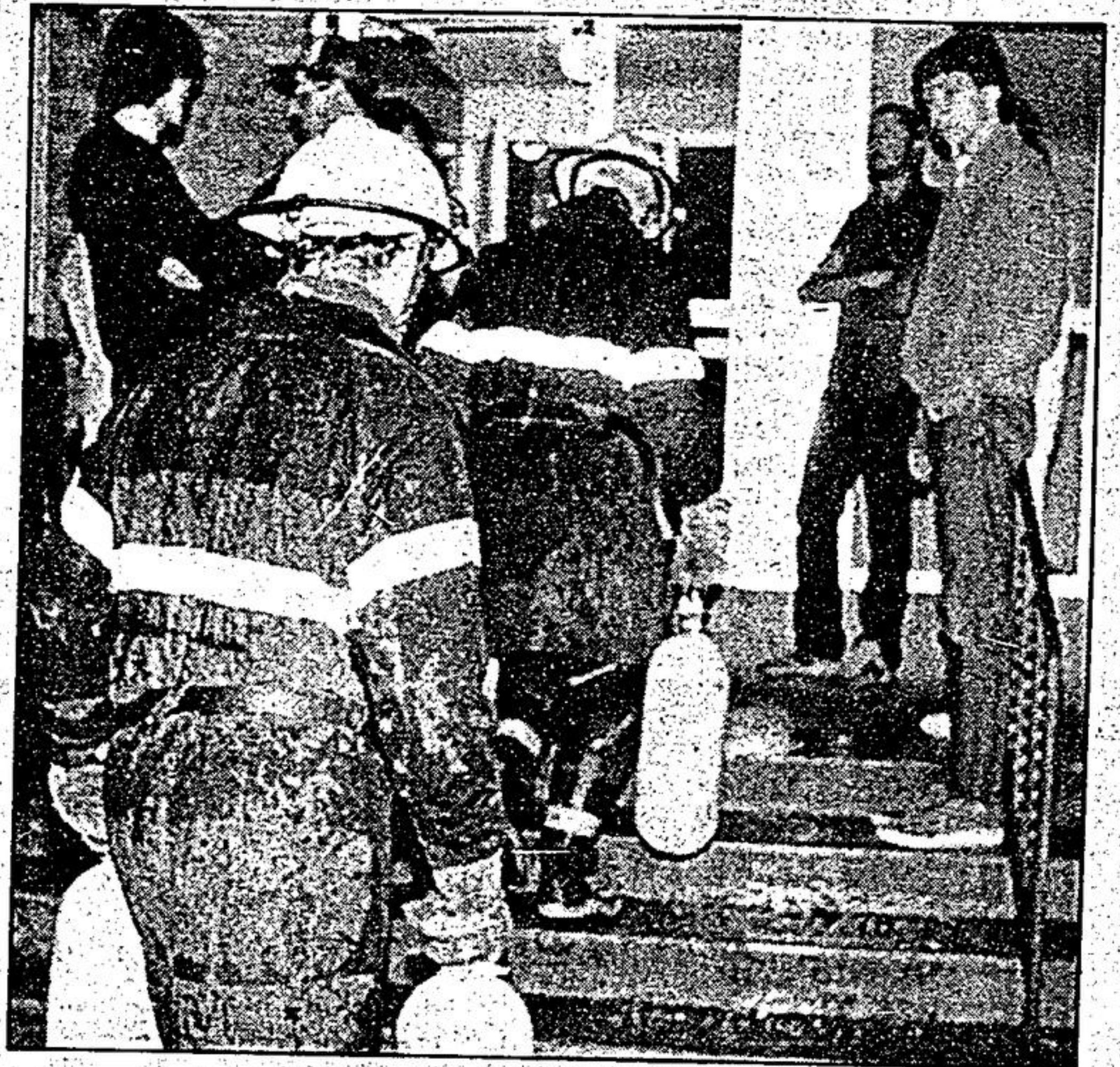
Fire damage was estimated at $7,000 in an early morning blaze yesterday in a Markham apartment building.