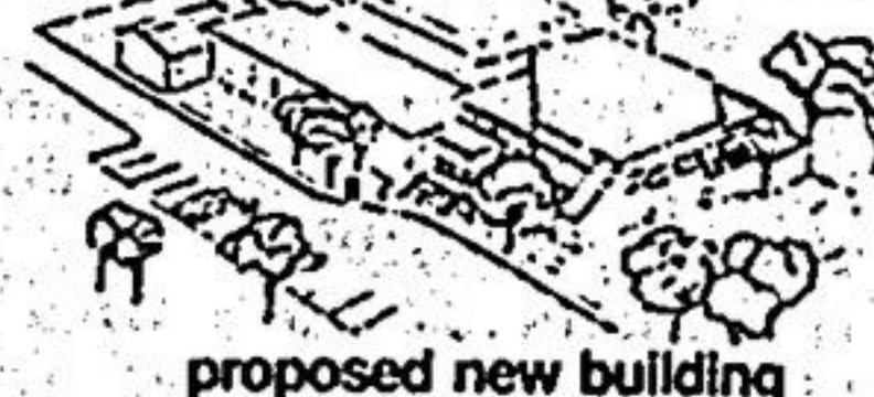
proposed new building