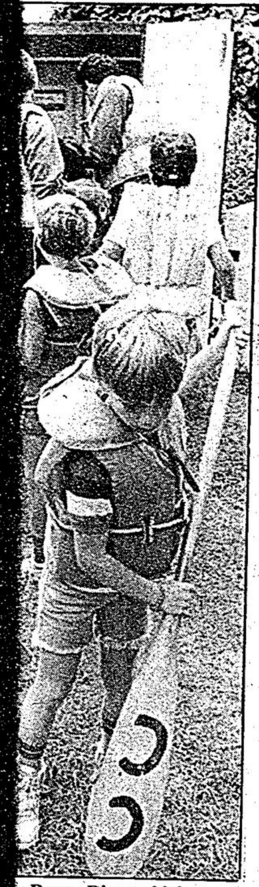
the Rouge River which runs