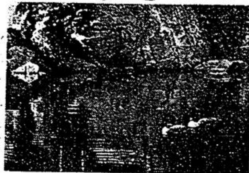
Northern Reflections - Loon Family by Robert Bateman

A Special Limited Edition of one of the world's most celebrated paintings.