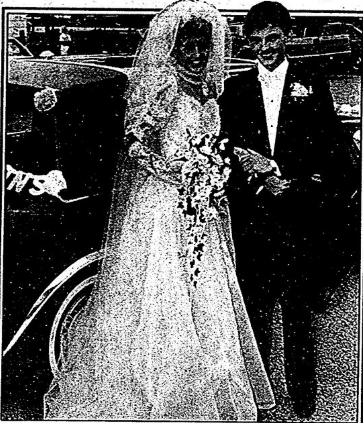
Pretty August wedding