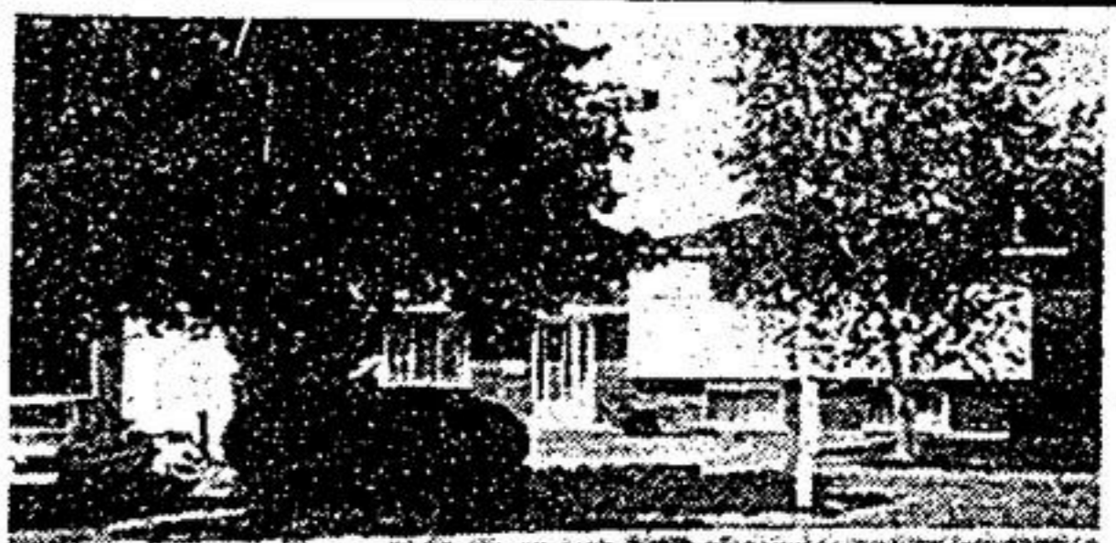
OPEN HOUSE SAT. 1-3 P.M.