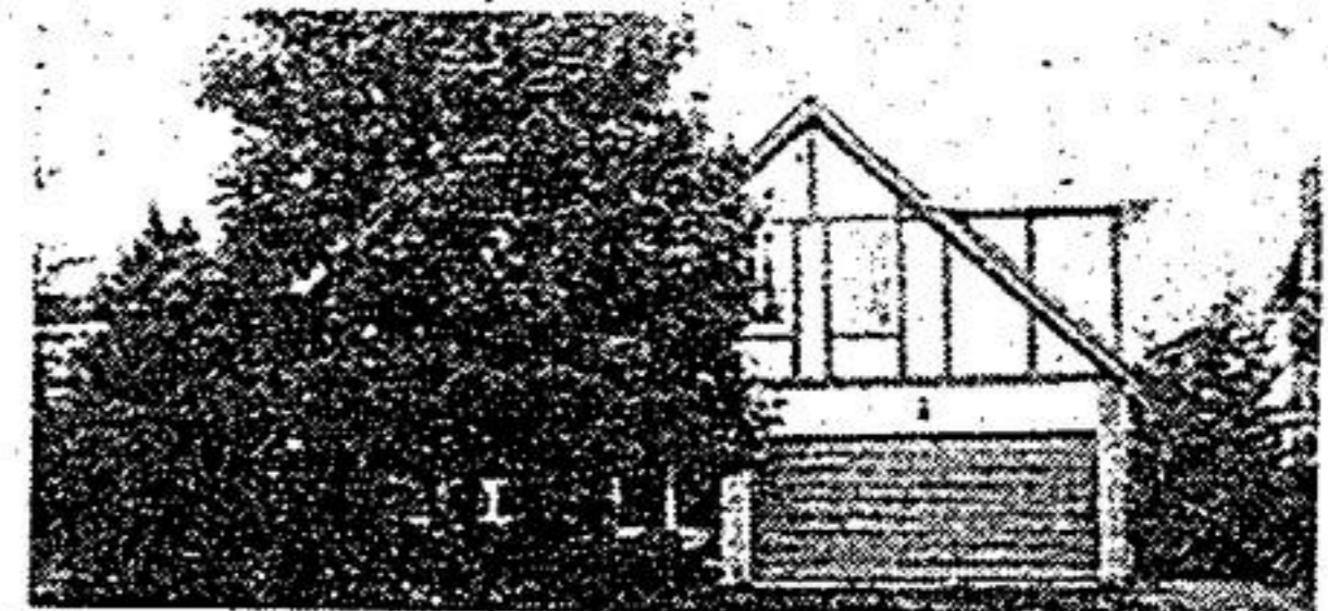
OPEN HOUSE SUN. 2-4 P.M.