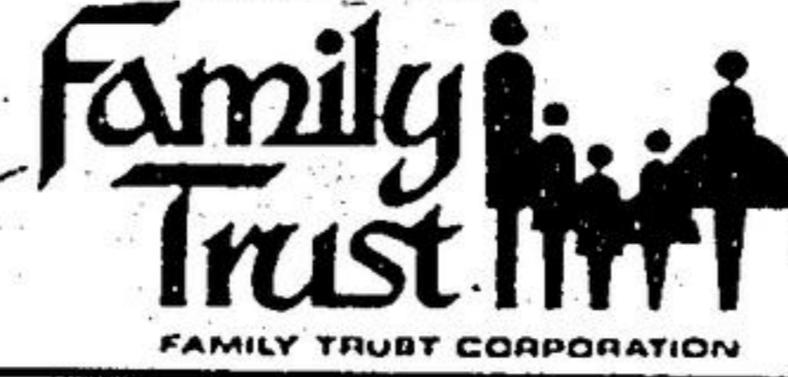
FOR RENT ELLESMERE/MIDLAND

$975. 2 storey, 3 B/R, eat-in kitchen, finished basement, good established area, walk to transportation, close to Town Centre.