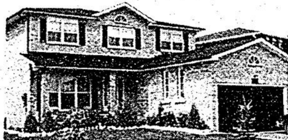
BETTER THAN NEW

4 bedroom, 3 bathroom deluxe Greenpark, 4 year old home, oak circular staircase, oak kitchen overlooks fully fenced garden, beautifully decorated and finished. Jack Brooks 294-1372.