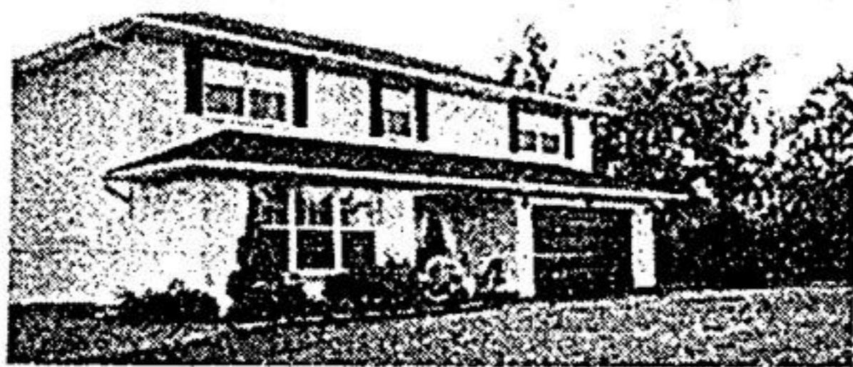
OPEN HOUSE SAT. 2-4 9960 WARDEN AVE.