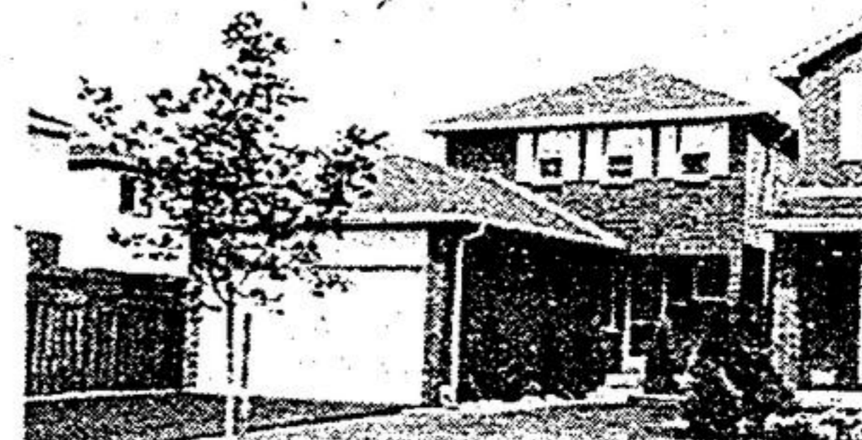
PRETTY AS A PICTURE

This 3 B/R home is tastefully decorated & is loaded with extras incl. 4 pce. ens. & main flr. fam. rm. + fireplace. Don't miss it! Paul Tate 294-1372.