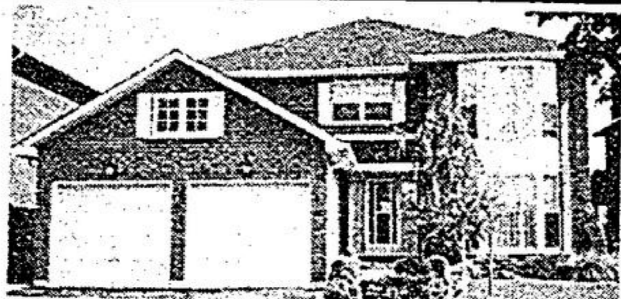
TOO GOOD TO BE TRUE!

$274,900. 5 bedroom Greenpark backing to conservation and park. Ceramics, oak, wet bar, finished basement, immaculately cared for inside and out. Beautiful landscaping. John or Linda Hawco 294-1372.