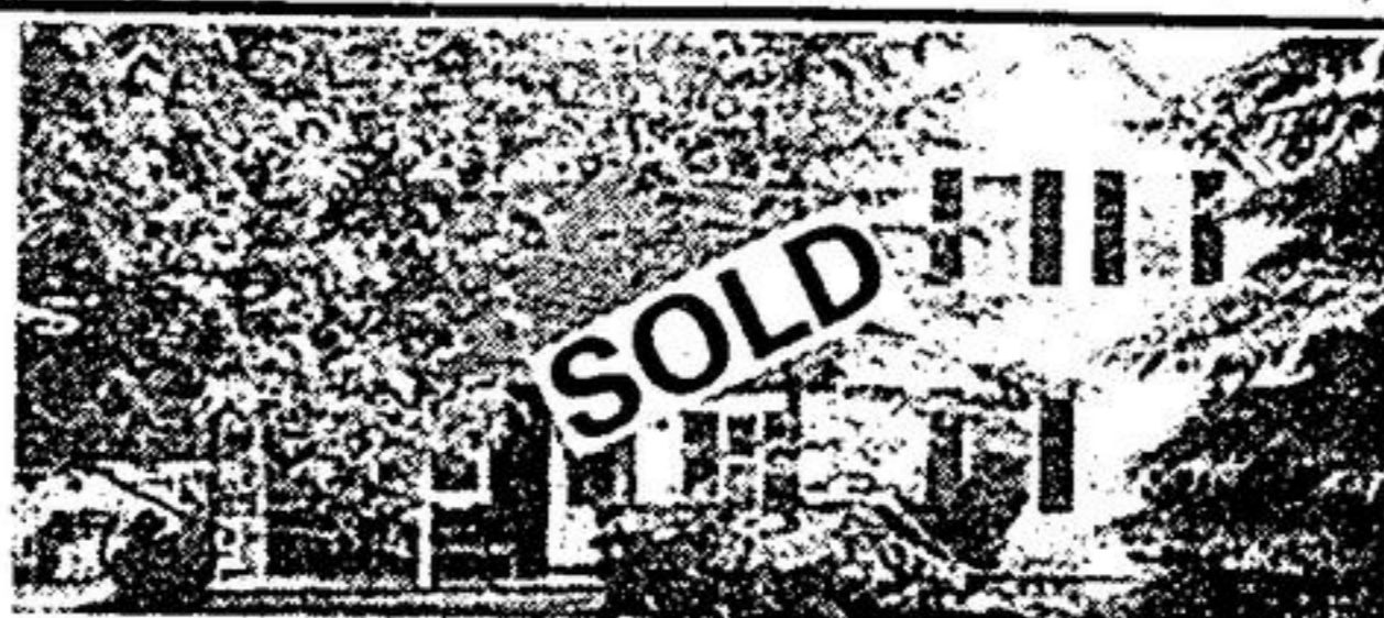
15 STATION ST. CENTURY CHARMER!

1½ storey, 3 bedrooms, pretty as a picture on beautiful treed lot.