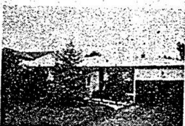
SIR TRISTRAM PLACE

EXPANSIVE NOT EXPENSIVE!! Huge eat-in kitchen, fa. rm. & fireplace, hardwood, treed lot, cres. location, cen. air, more!! $197,500. Jennie Cook/Don Hamilton 294-2533. #7.