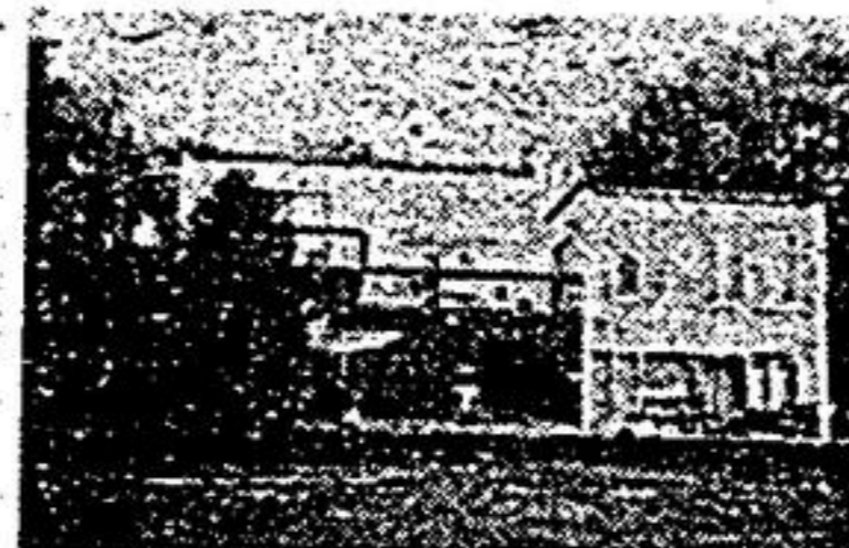
ROUGE RIVER CIRCLE

RAVINE - RAVINE - RAVINE! Backing onto stream this custom home w. Betz pool offers you an unbeatable lifestyle. $415,000. Barbara Raffensperger 294-2533. #2.