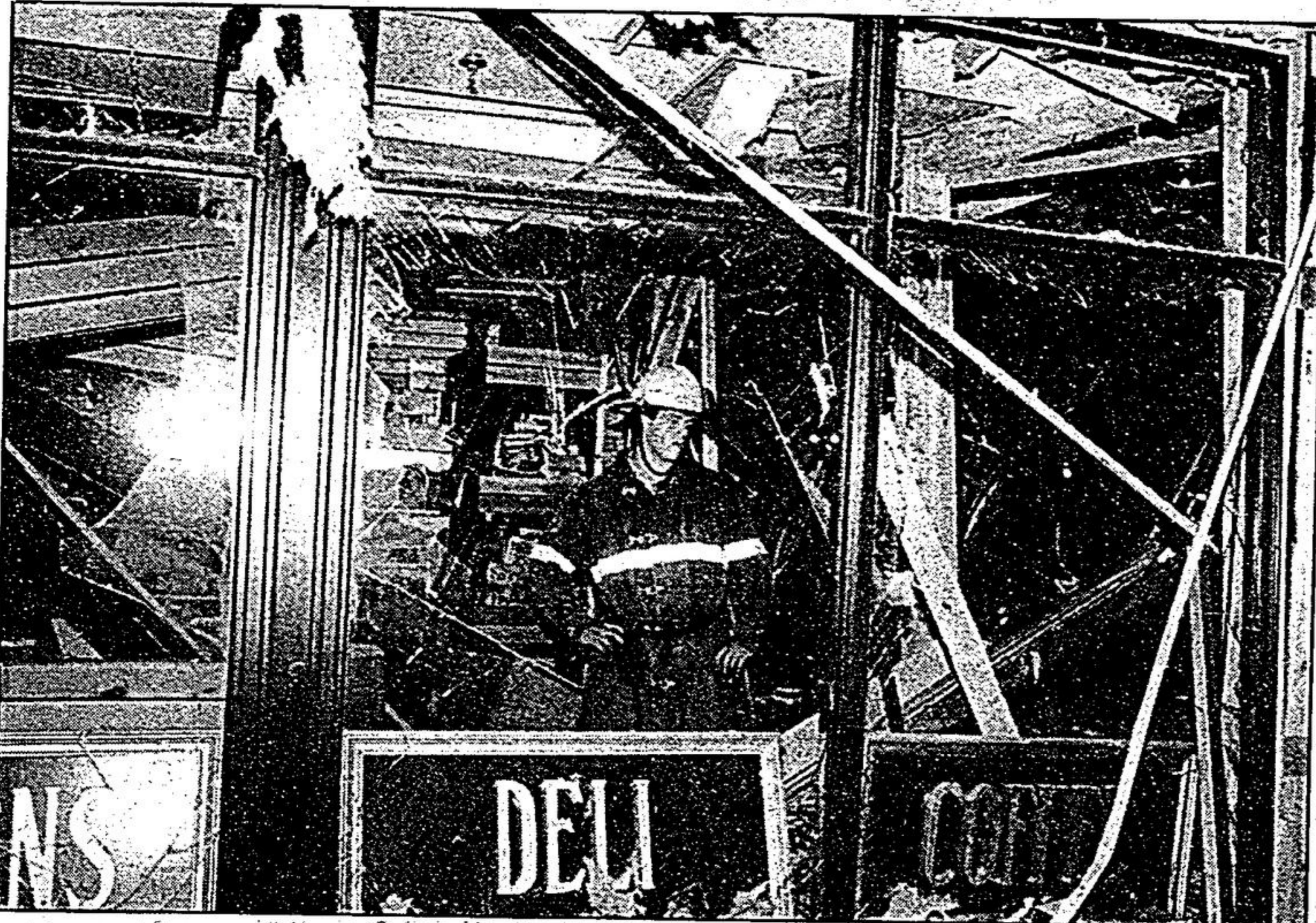
A Markham firefighter looks through the rubble in Markham Village Grocers following Thursday's early-morning explosion at Markham Village

Lanes on Main St. Forensic experts are continuing their investigation to determine the cause of the blast. No one was injured.