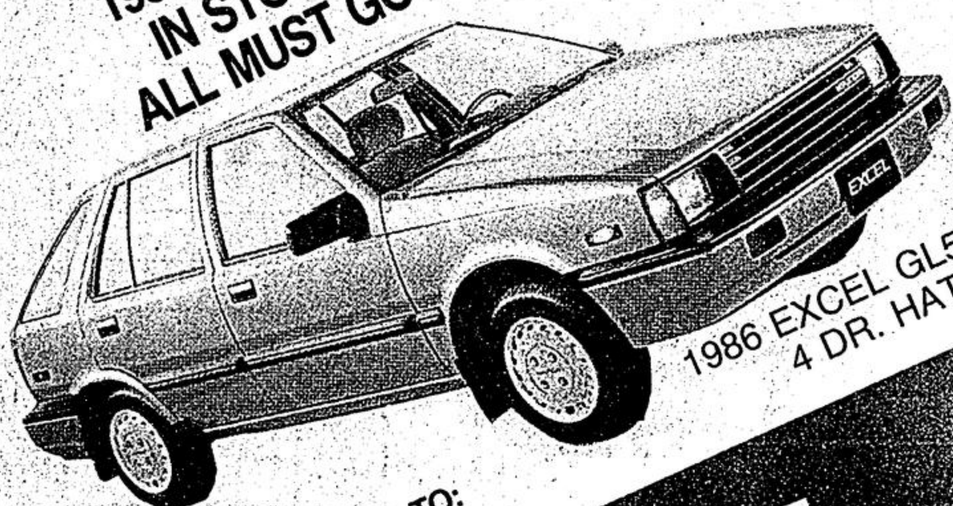
1986 EXCEL GL5 SPEED 4 DR. HATCHBACK

9 12 * BRAND NEW 1986 EXCELS IN STOCK ALL MUST GO