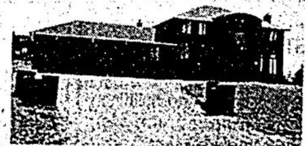
ONE ACRE ESTATE PROPERTY

4000 sq. ft. of luxury, this 9 room estate home features hardwood flooring, 3 marble fireplaces, sauna, whirlpool, plus so much more. Don Leyland 477-1270.