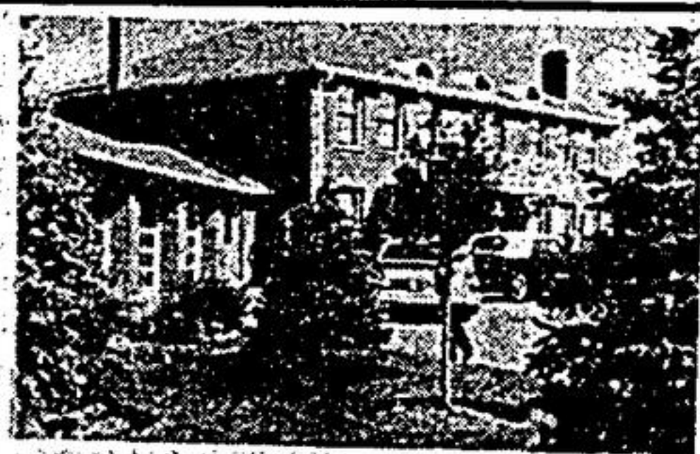
"ONE OF A KIND" BRIDLE TRAIL UNIONVILLE

This stunning customized 9 room executive's dream features designer bathroom fixtures, 6 ft. whirlpool tub, oak staircase, loads of extras. Don Leyland 477-1270.