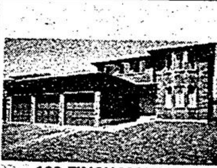
168 FINCHAM AVE.

TRY THIS FOR SIZE! POSSIBLE IN-LAW SUITE Spacious, neutral home in Markham Village has 4 bdrms, mnfr laundry & frms, CENTRE HALL PLAN! 3 1/2 baths including fabulous whipl tub, bsmnt is professionally finished with wtbar, sauna, 3 pc. bath & fpl. A MUST to see. $229,000. June Williamson 471-4800.